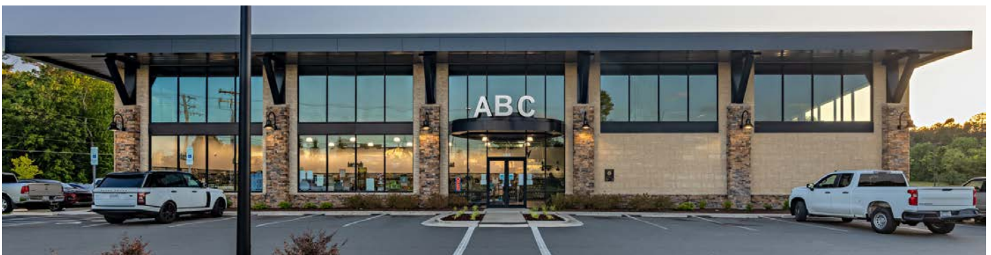
Hillsborough ABC Store on Oakdale Drive