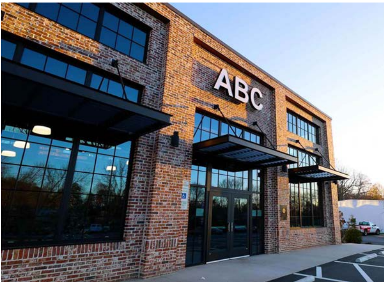
Mebane ABC Store on 7713 US Hwy 70