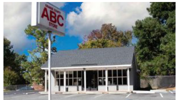
ABC Store at 201 Cornelius St. in Hillsborough

Cover photos: Orange County ABC Control Board operates retail stores throughout the county, including 2 locations in Hillsborough (bottom left) and 4 locations in Chapel Hill (bottom middle and bottom right), providing exceptional customer service while responsibly serving the community through controlled alcohol sales.