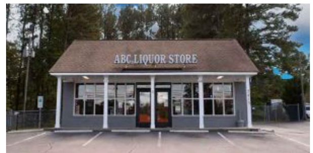
ABC Store located at 5413 US Hwy 70 in Durham

This is not simply an operational management role—it is an opportunity to shape the future of a respected public enterprise and unite stakeholders around the Orange County ABC's mission of responsibly controlling the sale of spirituous liquor, returning profits to law enforcement, alcohol education, and the Orange County General Fund while providing excellent service in customer friendly, modern, and efficient stores.