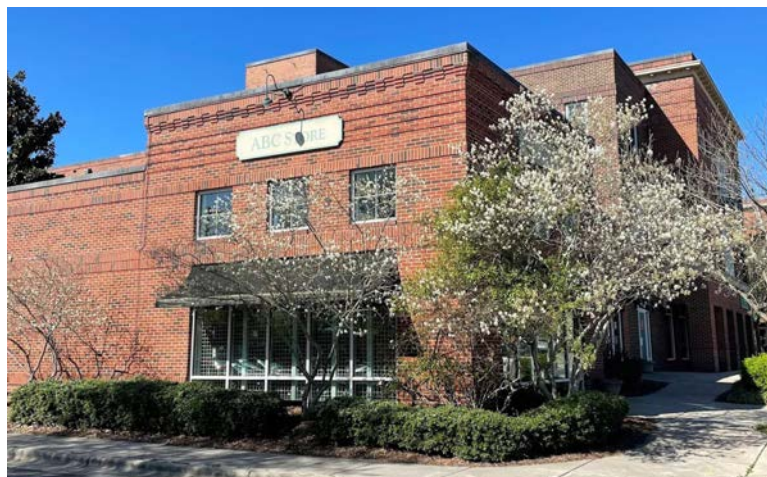
Chapel Hill ABC Store on West Barbee Chapel Rd

From inviting retail locations and well-stocked store interiors to warehouse and administrative operations, the Orange County ABC Board is committed to exceptional service. The General Manager provides strategic leadership while fostering a culture of trust, accountability, and operational excellence throughout the organization.