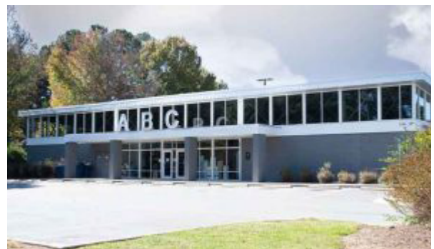
Orange County ABC's stores in Chapel Hill (left) and Carrboro (top) provide convenient access to exceptional customer service while supporting the Board's mission of responsible alcohol sales and community stewardship.