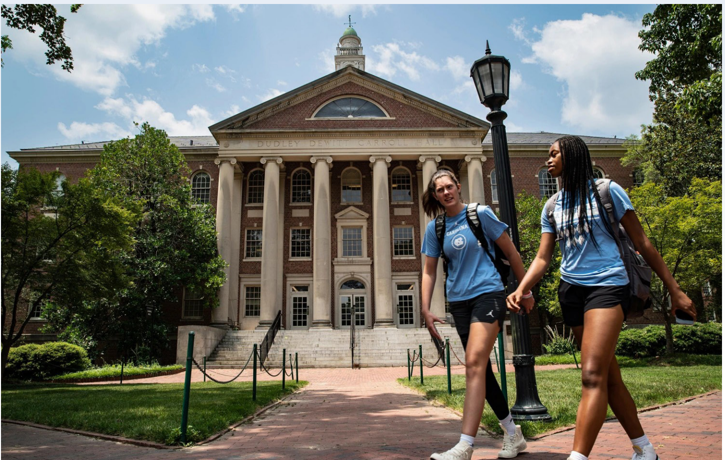
Students at North Carolina Central University (top) and the University of North Carolina at Chapel Hill (bottom) are part of a world-class higher education ecosystem that fuels innovation, research, workforce development, and economic opportunity throughout Orange County and the surrounding region.

Orange County is strategically positioned along the Eastern seaboard with major metro areas like DC and New York just a quick flight or few hours' drive away. Interstates I-40 and I-85 crisscross the region, facilitating quick and efficient travel in all directions and providing quick proximity to major universities, world-class healthcare, the Blue Ridge mountains, and Atlantic beaches.