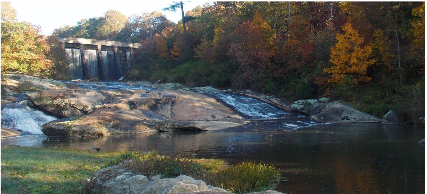
At Old Mill Pond Dam in Granite Falls, the Public Utilities Director's oversight ensures the continued maintenance and stewardship of critical water infrastructure, supporting community resilience, environmental balance, and reliable public services.