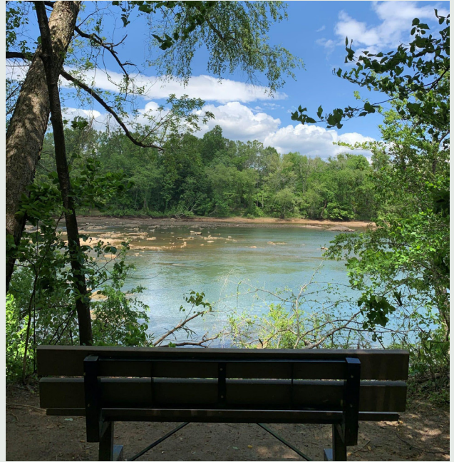
Blue Ridge Outdoors

Granite Falls' location provides convenient access to destinations such as Charlotte, Asheville, Blowing Rock, and the Blue Ridge Parkway, while still offering a peaceful, community-oriented environment. The Town has benefited from steady residential growth due to its affordability and proximity to Hickory, along with increasing commercial development along the Highway 321 corridor.