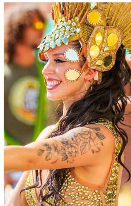
Community events and family activities bring people together in Concord throughout the year — from children taking part in the annual Christmas Parade (left), to families enjoying the city's parks and playgrounds (top), and colorful cultural celebrations such as the annual International Festival (right).