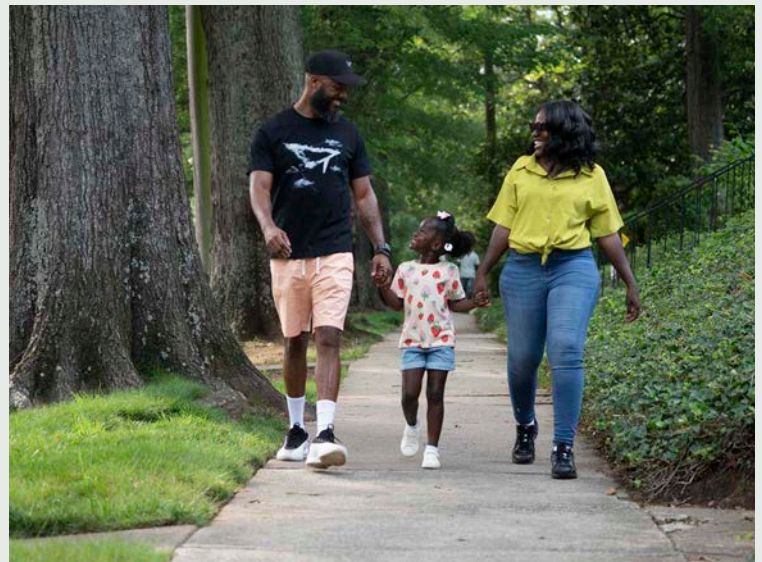
Neighbors wave and a family walks through a Concord neighborhood, reflecting the community connections fostered through the City’s Partnership for Stronger Neighborhoods program, which promotes relationships, communication, and quality of life across the city.