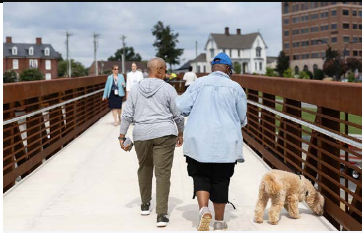
The Strollway (above), a popular 1.2-mile paved and gravel pedestrian-bicycle trail, links downtown to the historic Old Salem Museums & Gardens (below) and Salem Avenue.

Take a virtual tour to experience all that this vibrant community has to offer.