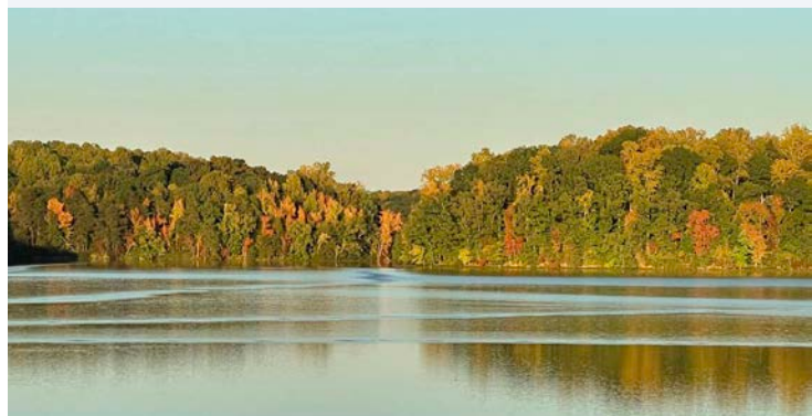
Salem Lake (above) provides a peaceful setting for outdoor recreation and nature views. A sprayground operated by the City (below) offers families a fun, accessible way to cool off during warmer months.