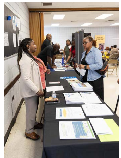
Staff with the City of Winston-Salem support community engagement through the City of Winston-Salem University (CWSU) program, guiding participants through a 12-week course on local government (left), and by hosting Neighborhood Services Open Houses (right), where community members learn about city divisions, receive updates, and ask questions—reflecting the City’s commitment to high-quality, responsive public service and its core values.