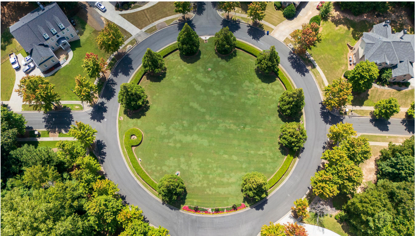
Walden Park is one of many master-planned residential communities driving economic growth by attracting new residents, increasing demand for local services, and expanding the city's tax base.

The South Fulton, GA, is an Equal Opportunity Employer.