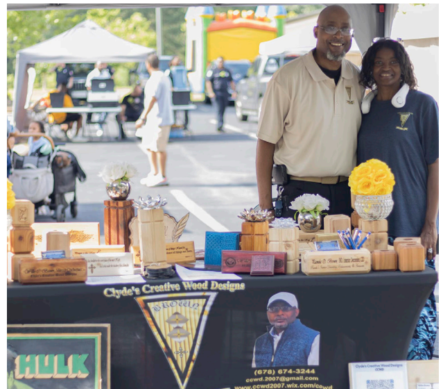
South Fulton is conveniently located to vital population and industrial centers, such as the Red Oak District, which serves as an arts and culture hub with local businesses.