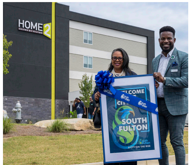
Two new hotel chains, Marriott and Hilton, opened in South Fulton, a significant step for the city's economic growth.