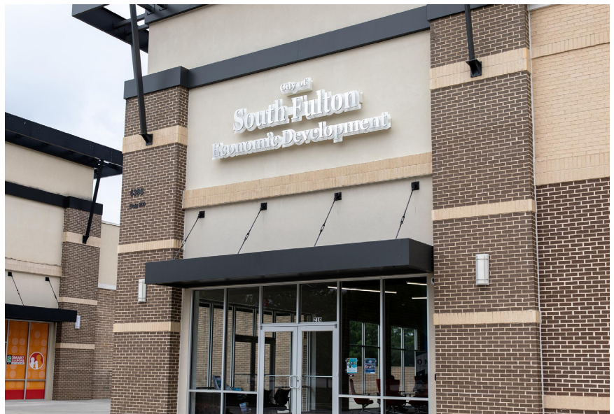
The Economic Development Director's office is located at 6385 Old National Highway, Suite 210