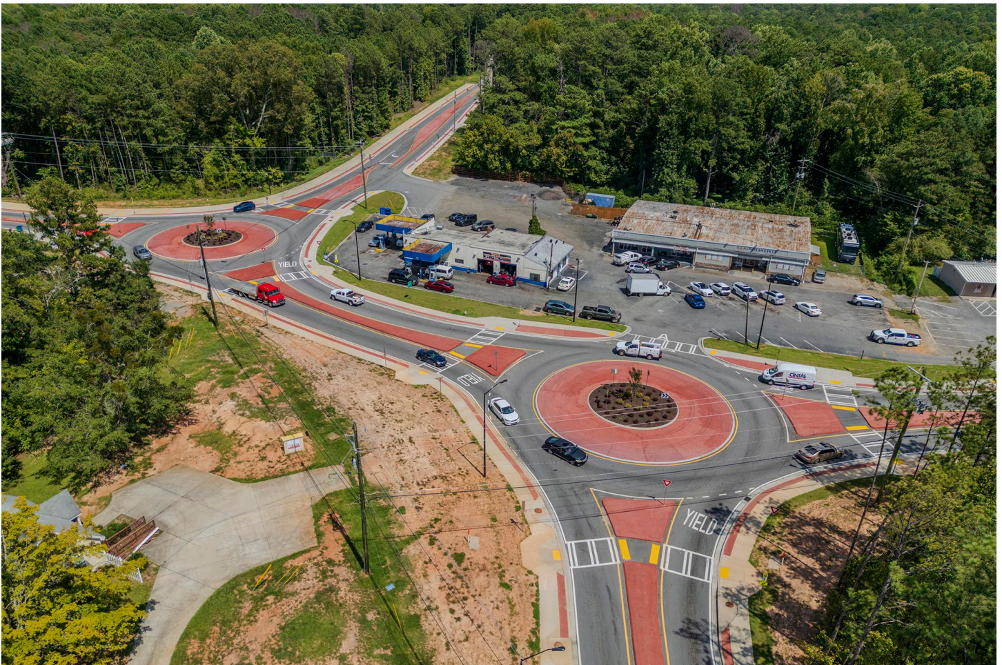
New road infrastructure in South Fulton, such as the Stonewall Tell & Butner Road Roundabout, is helping the community by improving safety, supporting economic development, and enhancing quality of life for both residents and workers.