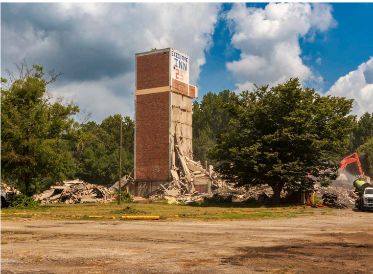
The redevelopment of the Fulton Industrial District involves a comprehensive strategy by both Fulton County and the City of South Fulton, focusing on improving public safety, infrastructure, and quality of life in the large industrial and business area.