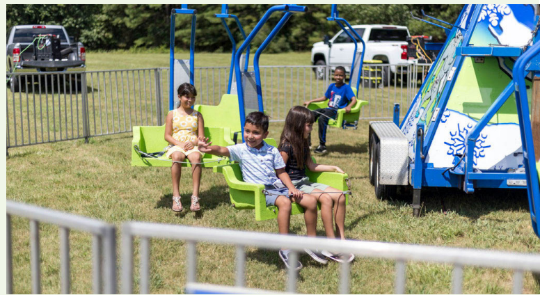
The annual Back to School Carnival & Book Bag Giveaway, supported by the City's elected officials and the Parks and Recreation Department, which provides students with free school supplies and book bags, while families enjoyed a variety of carnival-themed activities and entertainment.

Below: The Chattahoochee River in the South Fulton, GA area offers activities like hiking on its extensive trails, fishing for bass and catfish, and tubing and rafting on its calm waters. Visitors can also enjoy biking, bird watching, and exploring the numerous parks and green spaces along the river