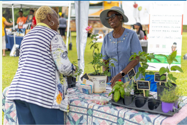
The Farmers Market at The Village Shops at Cedar Grove takes place every fourth Thursday of the month, seasonally.