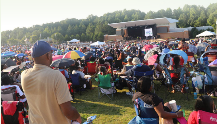
The Wolf Creek Amphitheater's peak performance season runs from May through September and provides the perfect location for outdoor live music concerts, plays, performances, and festivals.

The South Fulton community enjoys ample opportunities for entertainment and recreation. In addition to being in proximity to the abundant entertainment options in Atlanta, it is home to the Wolf Creek Amphitheater, which hosts a variety of concerts, plays, and festivals. It is near several nature preserves and parks and is less than a two-hour drive from the foothills of the Appalachian Mountains. The Chattahoochee River runs nearby, providing water access. Additionally, the warm southern climate produces plentiful hardwood and pine forests, making the area a beautiful place to live.