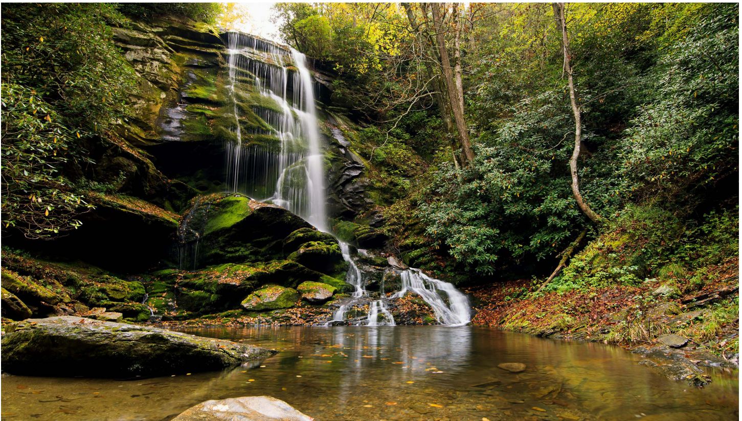
Catabwa Falls near Asheville

The City of Asheville, NC is an Equal Opportunity Employer.