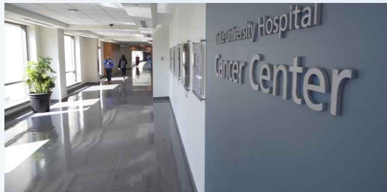
Durham is renowned for its world-class medical facilities.