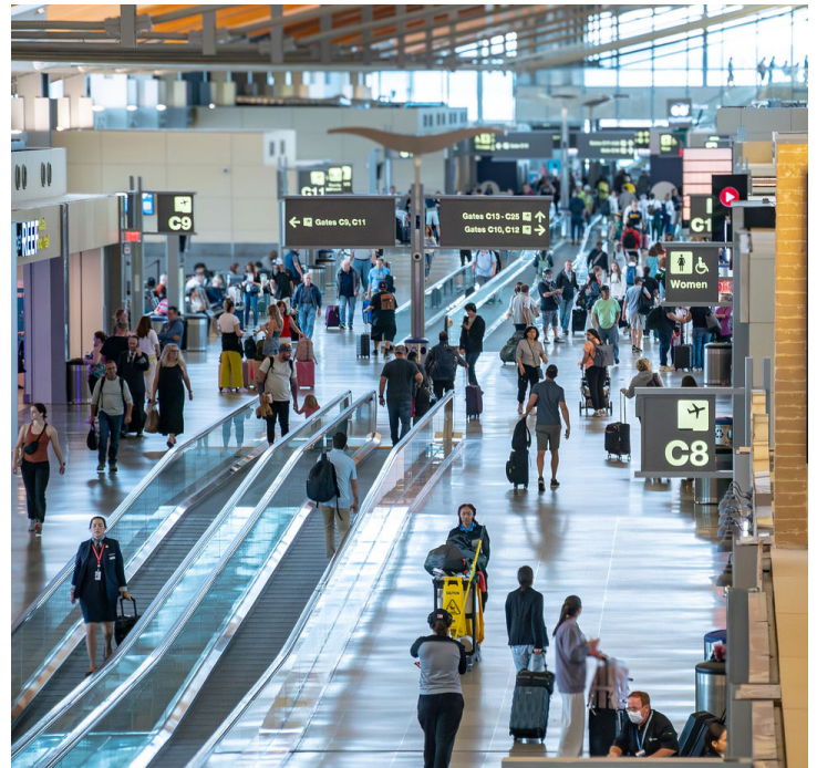
A bustling and growing airport, RDU is served by 19 airlines and offers flights to over 80 nonstop destinations across the United States, Canada, Mexico, Europe, and the Caribbean.