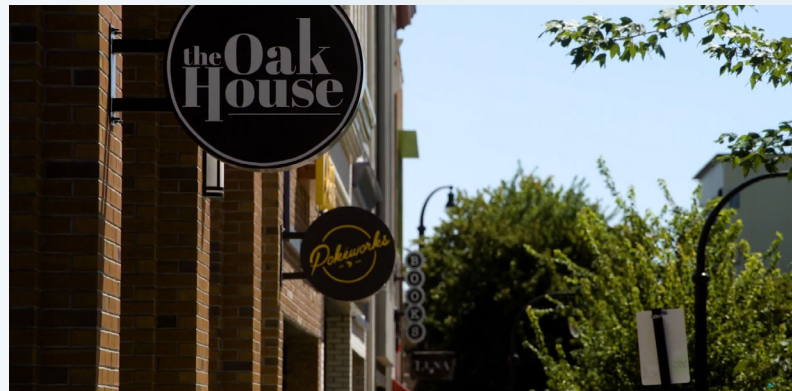
Downtown Durham bustles with diverse restaurants, breweries and small businesses.