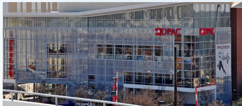
The Durham Performing Arts Center, known as the DPAC, is the largest performing arts center in the Carolinas.