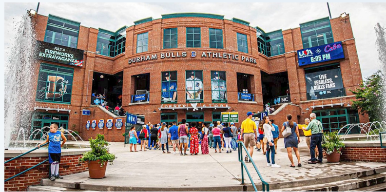
The AAA Durham Bulls baseball team attracts fans from all over the state.