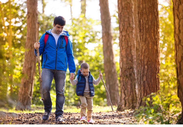
Guilford County offers community residents so many opportunities to enjoy the outdoors — from hiking and and mountain biking trails to greenways, parks and lakes.