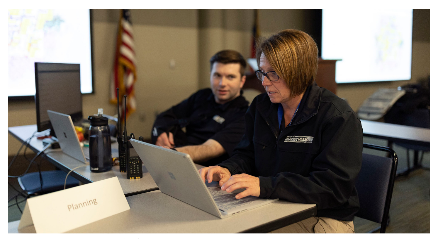
The Emergency Management (GCEM) Division oversees a range of programs, including emergency preparedness, hazard mitigation, and coordinated response efforts.

Guilford County is an Equal Opportunity Employer.