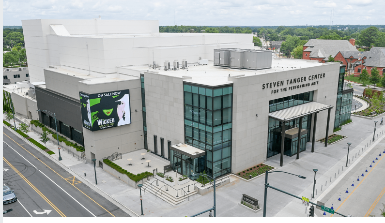
The Steven Tanger Center for Performing Arts is a state-of-the-art-multi-purpose facility with a seating capacity of 3,000.

Cultivate Your Career. Nurture Your Community.