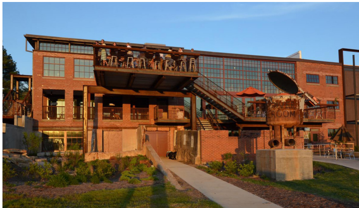
The Haw River Ballroom, located in the former mill village of Saxapahaw features three levels, a riverside deck, a concessions bar and coffee shop, and an idyllic rural setting. visitalamance.com

With a wide range of recreational and cultural activities, Alamance County continues to grow due to its appeal to families, professionals, and retirees alike. Outdoor enthusiasts love Cane Creek Mountains Natural Area , which features scenic hiking trails and opportunities for wildlife observation. The Haw River Trail , (below) part of the larger Mountains-to-Sea Trail, provides a beautiful route for hiking, paddling, and birdwatching. The former mill villages in Saxapahaw , located along the Haw River, have been revitalized and are now a local hotspot known for a vibrant arts scene, delicious farm-to-table dining, and the popular Saturdays in Saxapahaw music and farmers market series. The Alamance Partnership for Children is located in a former mill along the Haw River north of downtown Burlington.