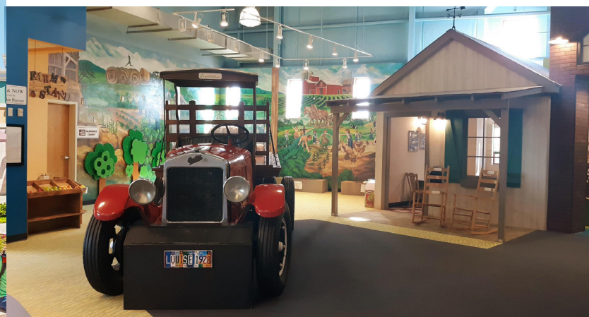
Not just for children, The Children's Museum of Alamance County provides environments where children and adults are given a unique opportunity to play and create together. Children's Museum