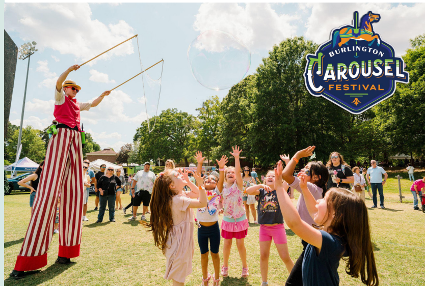
The Carousel Festival held every spring at Burlington City Park offers fun events for the whole family.

Alamance County also offers family-friendly attractions such as the Burlington City Park , which includes a historic carousel and miniature train, and the Children's Museum of Alamance County in Graham. Nearby, the Animal Park at the Conservators Center provides a unique opportunity to see lions, tigers, and other exotic animals up close on guided tours. Shopping and dining options abound in downtown areas like Burlington and Graham, which are home to local boutiques, breweries, and restaurants. Additionally, the Tanger Outlets in Mebane (below) attract shoppers from across the region.