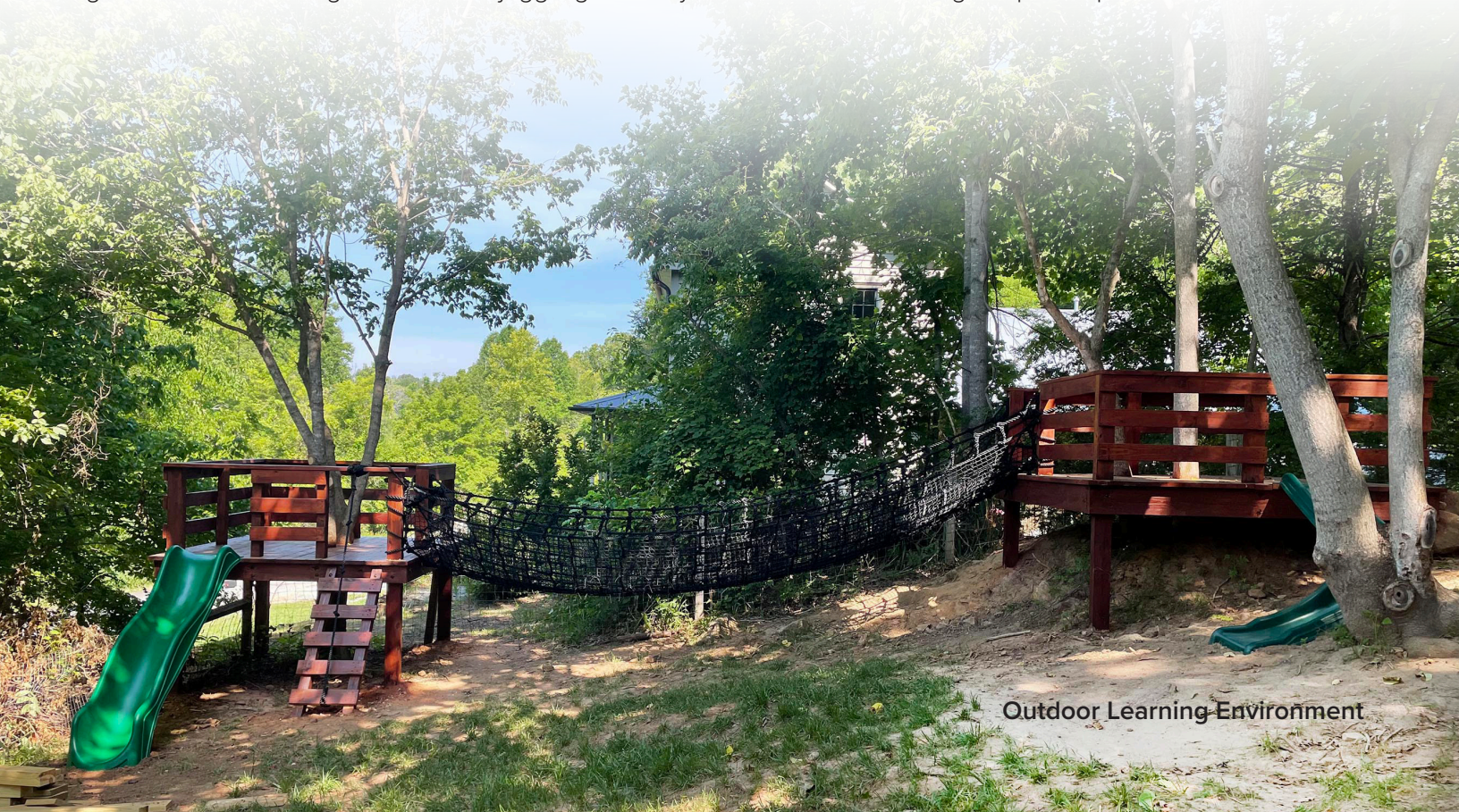
Outdoor Learning Environment

Reporting to the Board of Directors, the next Executive Director will effectively manage the organization's $5.2M+ budget and a team of 15 employees (14 FTE and one intern). The Executive Director will seamlessly balance maintaining a presence in Alamance County, interacting with key stakeholders and partners while ensuring the strategic direction of the organization and juggling the daily demands of overseeing nonprofit operations.