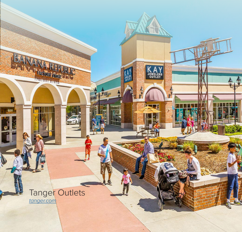
Tanger Outlets tanger.com