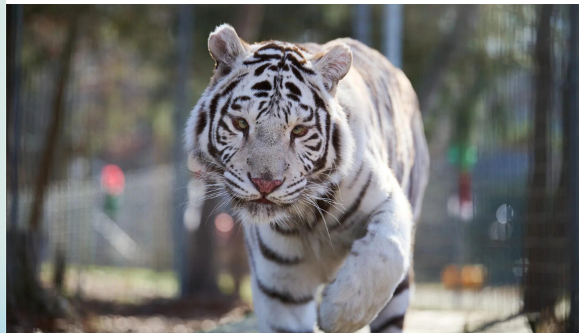
The Animal Park at the Conservators Centers gives visitors of all ages the opportunity to see exotic wildlife up close. nscsciencecenter.org