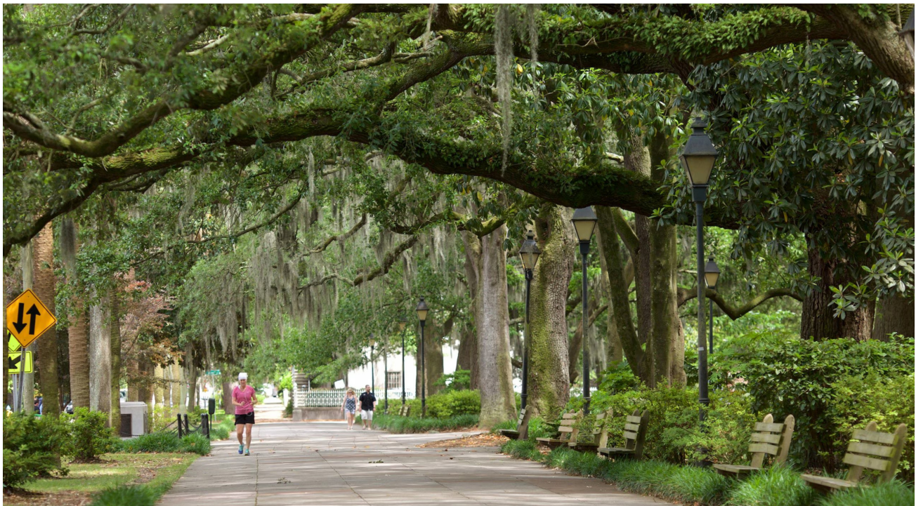
Spanning more than 30 acres, Forsyth Park is Savannah's largest and oldest public park, where festivals, concerts and the weekly Forsyth Park Farmers' Market are held.

The City of Savannah, GA, is an Equal Opportunity Employer.