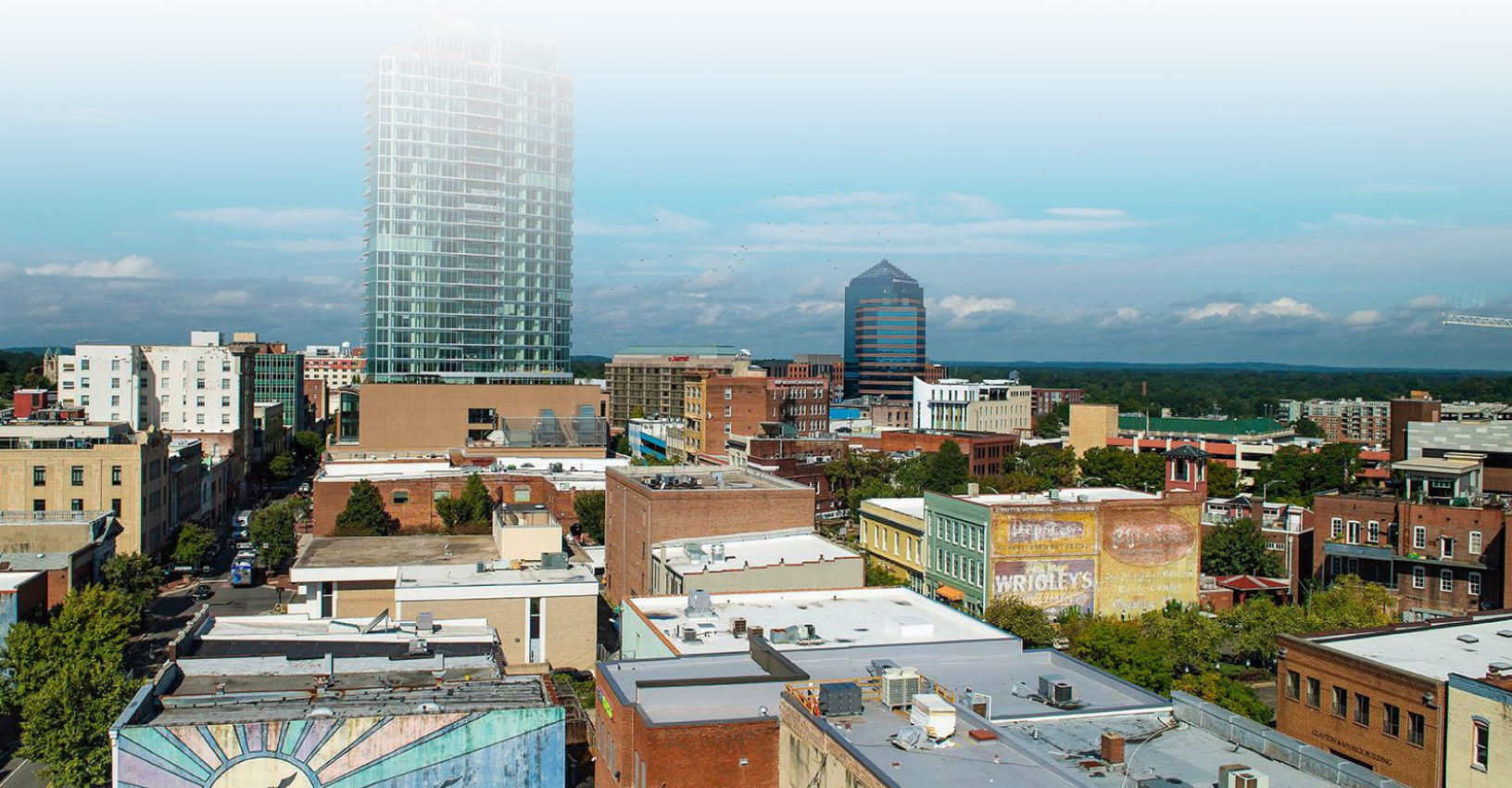
Downtown Durham skyline

Durham County is an Equal Opportunity Employer.