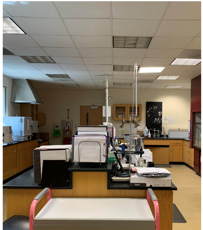
The Laboratory Services program administers a broad range of analytical activities related to surface water quality, water treatment, wastewater treatment, and industrial wastewater