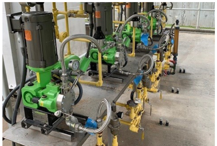
Chemical feed pumps