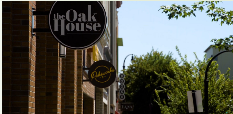
Downtown Durham bustles with diverse restaurants, breweries and small businesses.