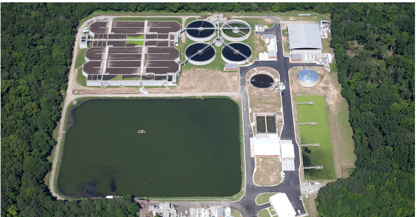
Aerial view of Triangle Wastewater Treatment Plant

The Superintendent will be a highly competent wastewater and environmental professional with extensive experience and technical knowledge in the operation and process control of wastewater treatment processes, as well as the operation and maintenance of wastewater collection and pumping systems. This position will lead with a customer service focus that effectively serves all internal departments of the County and will work to meet County regional water quality to ensure customers have safe and dependable utility services.