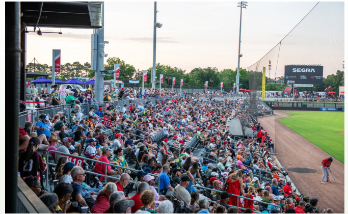
Segra Stadium, home of the Fayetteville Woodpeckers, is one of several entertainment venues located in Fayetteville.

Learn more about the opportunities in Fayetteville here and get a taste of what a weekend is like in Fayetteville by watching this short video .