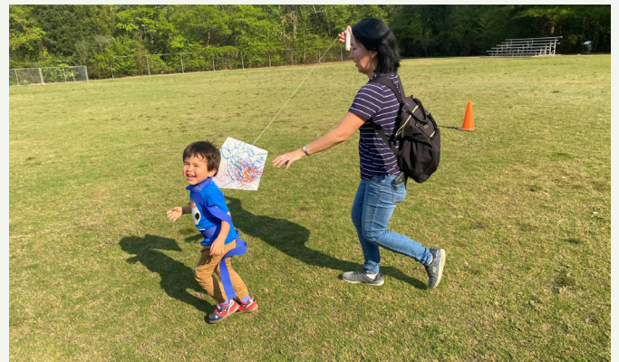
Whether you want to take a stroll on the one-mile border trail through the wetlands to Bones Creek, play a game of tennis, fly a kite or have a family picnic, Lake Rim Park offers something for everyone.