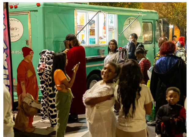
Among the many activities supported by the CSDD are Zombie Walk, a free family-friendly event with food trucks, vendors, artists and more (above left), and 4th Friday, which features visual and performing arts, live music, street performers, and local businesses and is held on the fourth Friday of each month from March to October (above right).