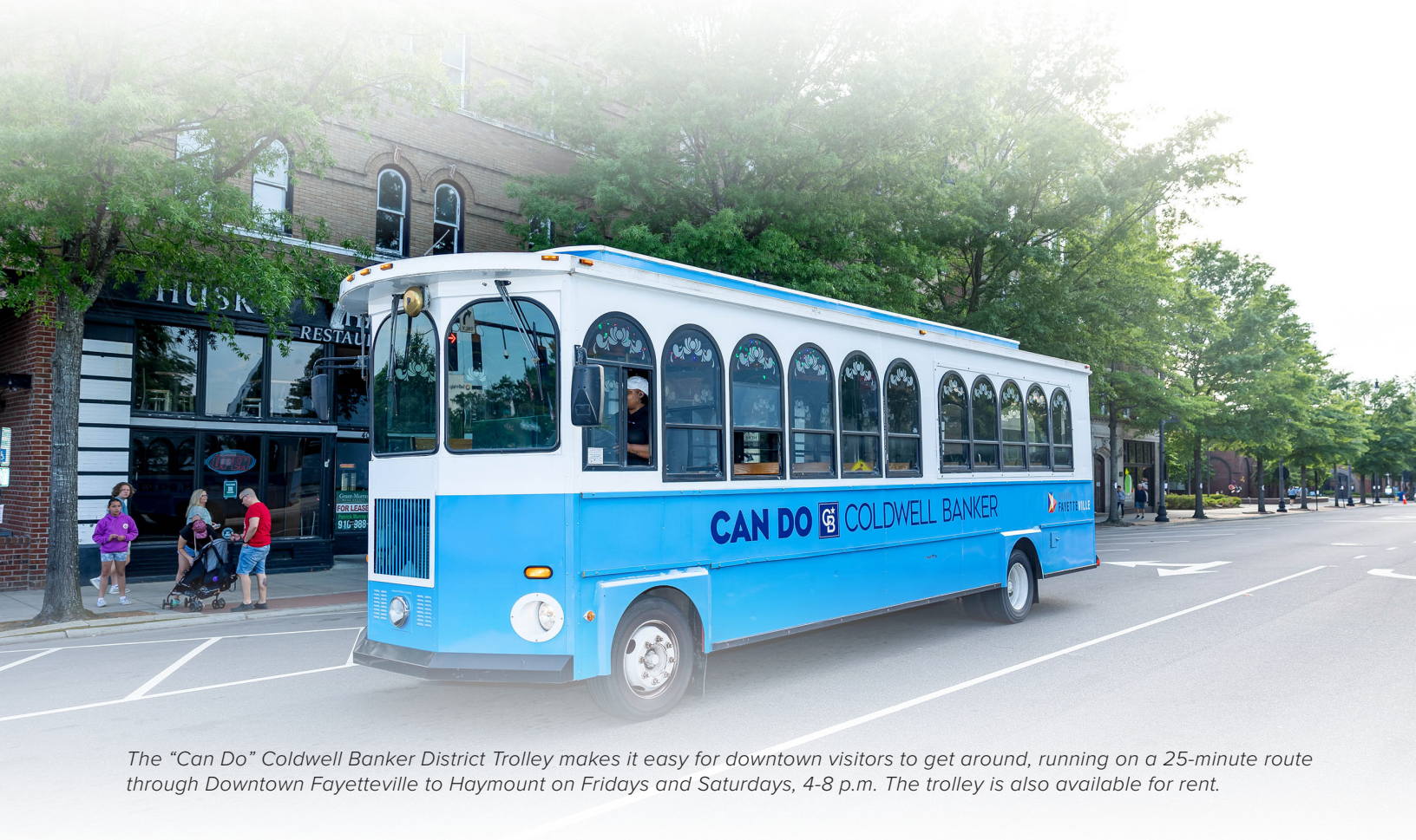
The “Can Do” Coldwell Banker District Trolley makes it easy for downtown visitors to get around, running on a 25-minute route through Downtown Fayetteville to Haymount on Fridays and Saturdays, 4-8 p.m. The trolley is also available for rent.