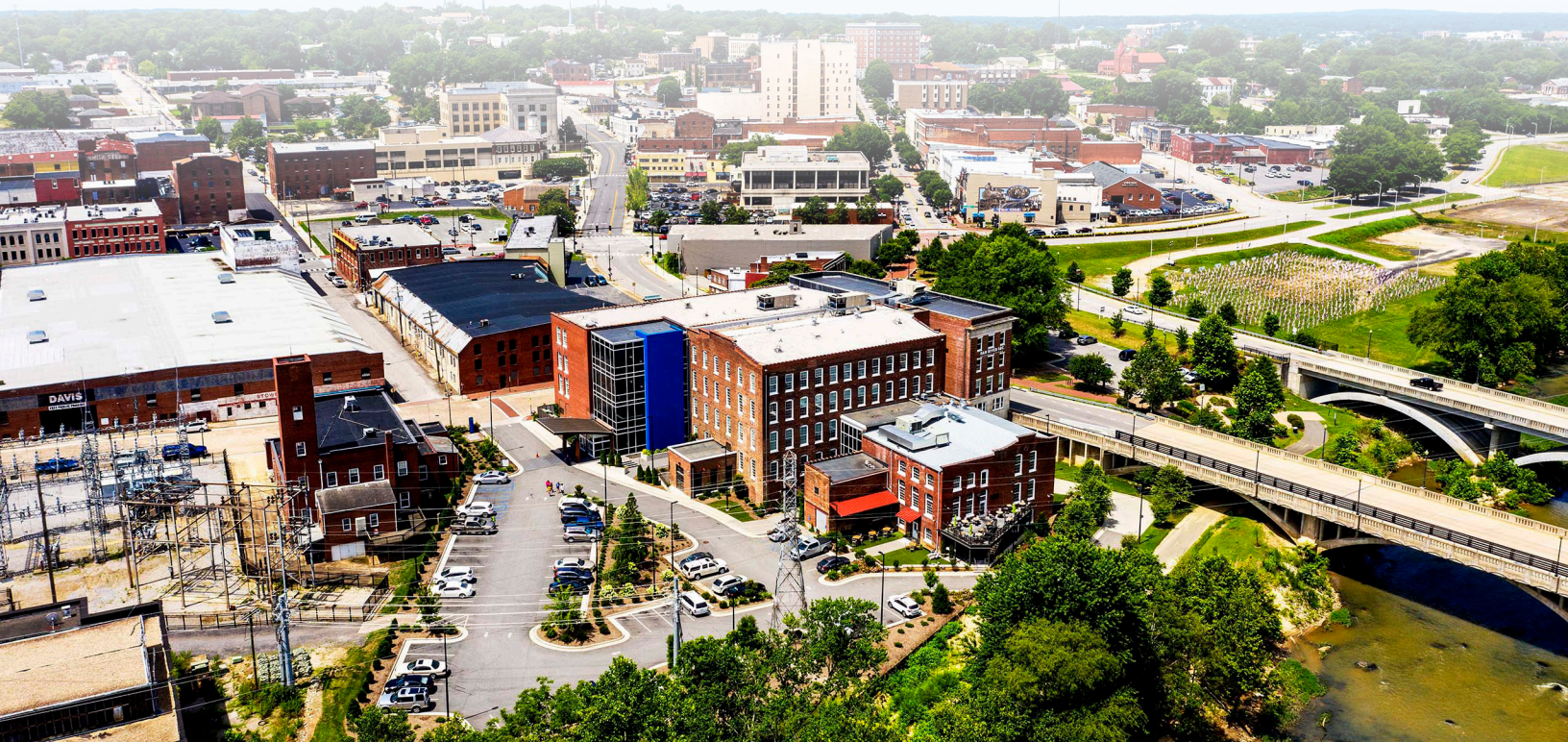
Danville River District aerial view