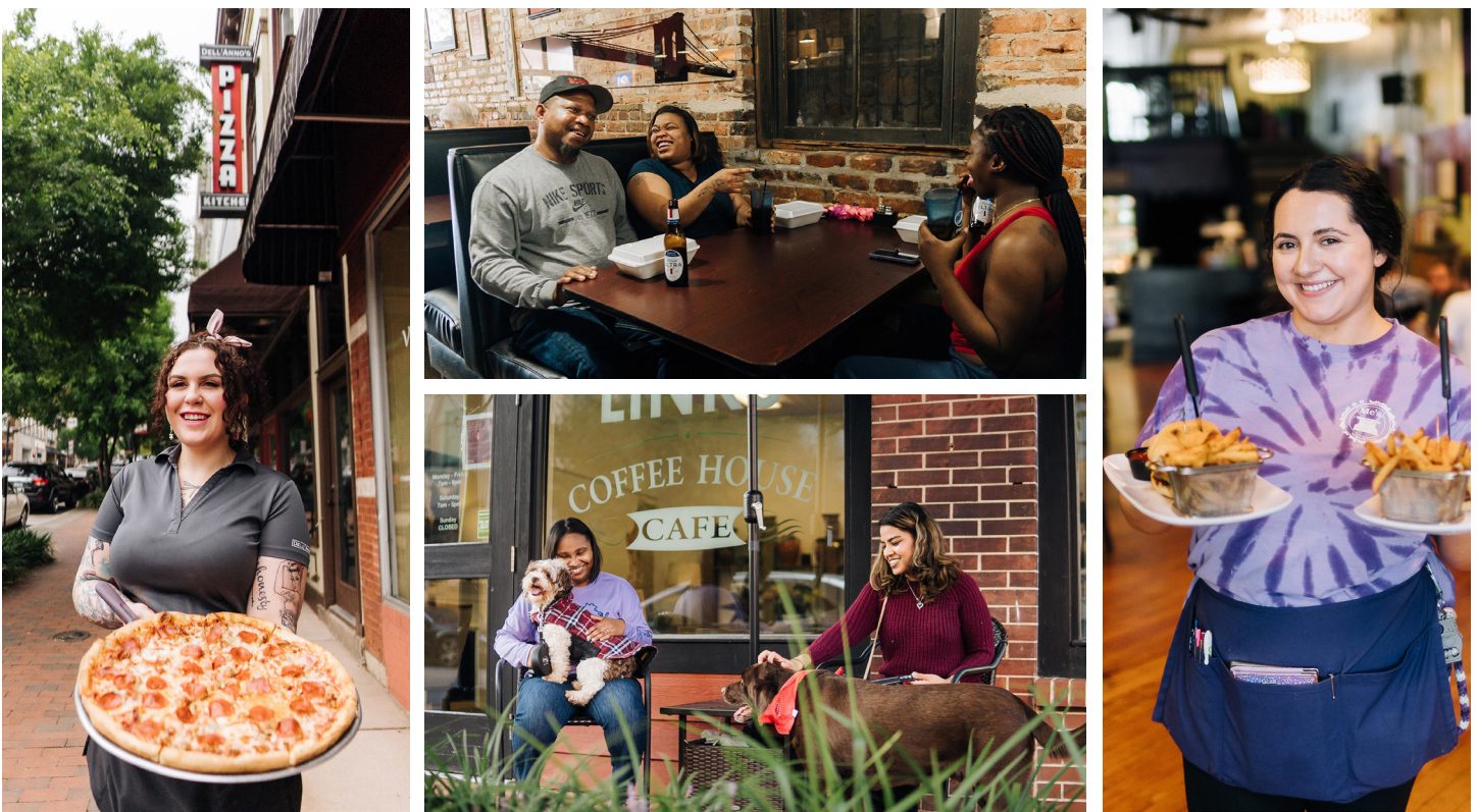
From pizza and burgers to coffee shops and cafes, downtown Danville is the place to go for good food with good friends.