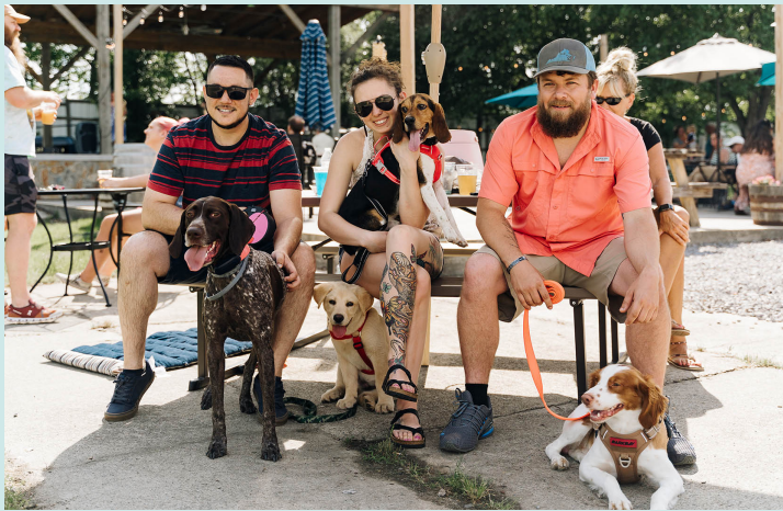
Enjoying a cold beverage on a hot day with friends (both human and furry!) is a favorite way to pass the time in Danville.

To learn more about what Danville has to offer, view this Regional Tourism Video!