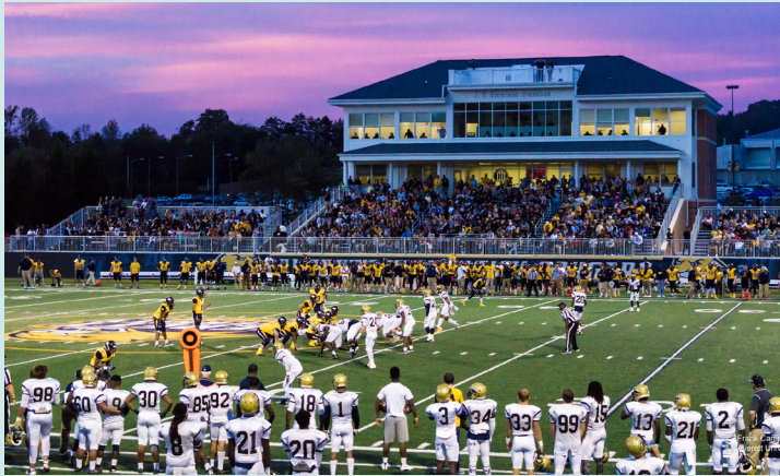
Averett University offers its students a wide variety of sports to play and cheer on, including football.

Southern Virginia was built on furniture, textiles, and tobacco manufacturing, attracting people from around the world to live and conduct business. However, between the 1990s and mid-2000s, these industries declined significantly, forcing the region to adapt and diversify its economy. In response to the loss of over 25,000 jobs, regional leaders developed a long-term strategy focused on workforce development, aiming to create higher-paying jobs and drive economic growth. Over the past two decades, this approach has fostered strong partnerships among local governments, educational institutions from Pre-K to college, and businesses. Additionally, investments in quality-of-life improvements have enhanced the region's appeal to residents, workers, and visitors. Since FY 2017, Southern Virginia