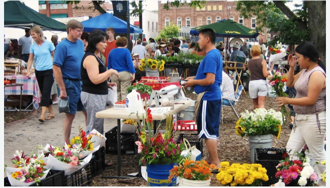
A popular event April-October is the Evening Farmers Market, which is open every Thursday from 3:30-6 p.m.

Nearly 21,000 students are enrolled in the Iredell-Statesville Public Schools with a student-teacher ratio of 16 to 1. Private school offerings for families include Cornerstone Christian Academy, Statesville Montessori School, and Statesville Christian School. Nearby colleges include Davidson College, Livingstone College, and Catawba College. Mitchell Community College, located in the heart of Statesville, provides many secondary education opportunities to nearly 1,800 students.