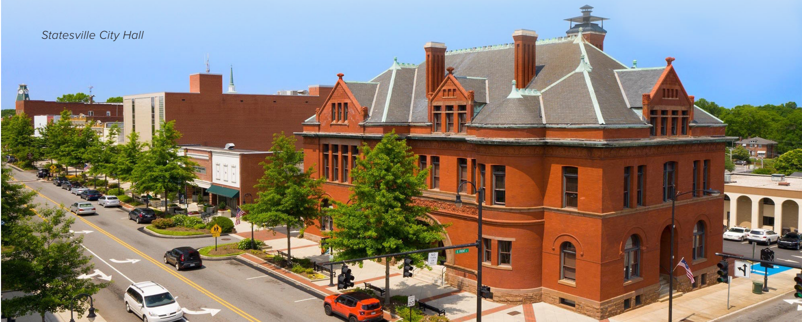
Statesville City Hall