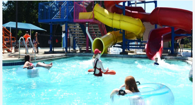
The Statesville Leisure Pool offers many special events during the season, including Movie Night and Dog Day at the Pool for the furry members of the community!