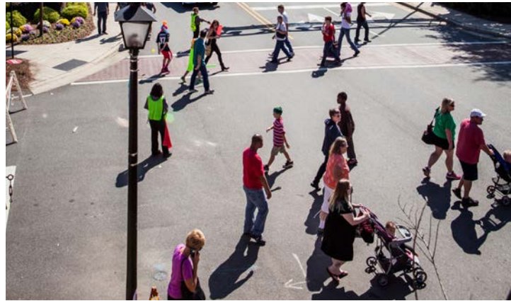
Waxhaw has a vibrant downtown with an eclectic variety of shops and restaurants.