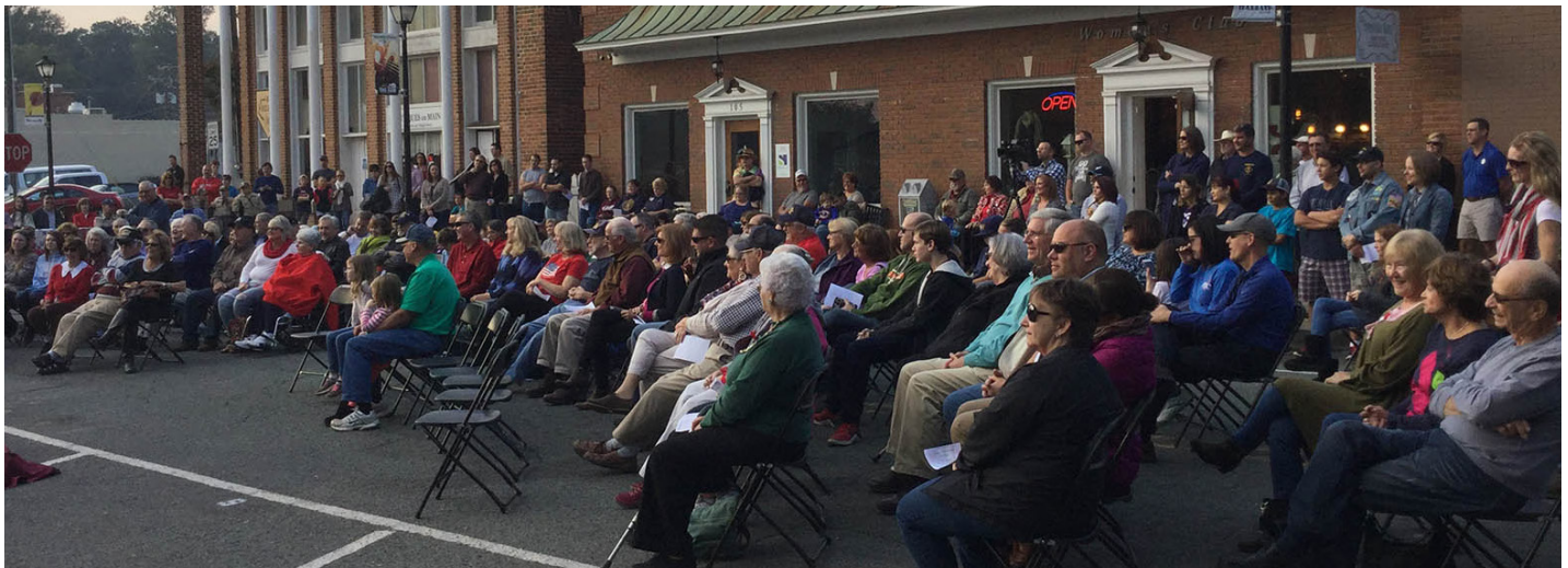
Downtown Waxhaw serves as a primary community gathering spot for a multitude of seasonal events held throughout the year.

The Town of Waxhaw, NC, is an Equal Opportunity Employer.