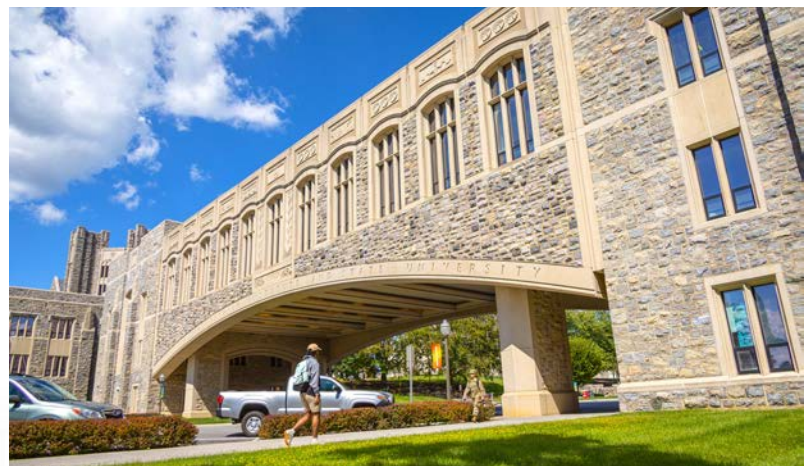
Torgersen Bridge, a well-known landmark, at Virginia Tech