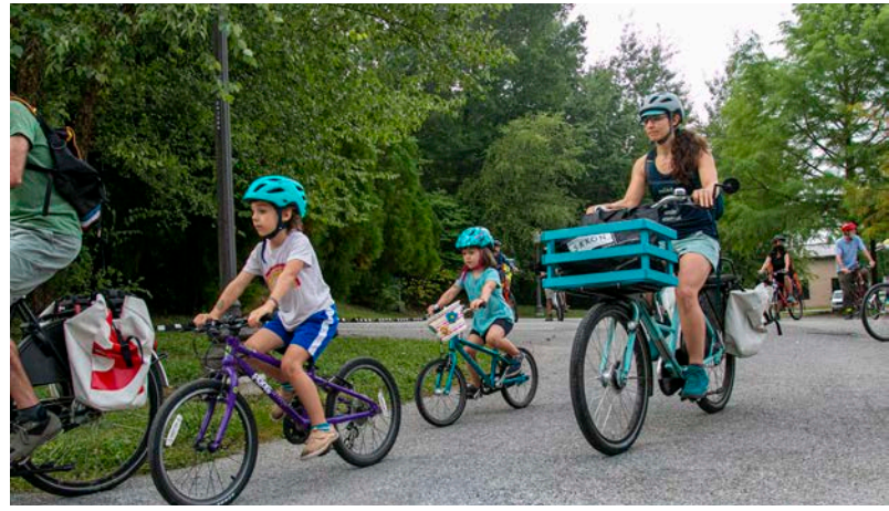
The annual Blacksburg Bike Parade to create sustainability is a fun, family-friendly event that begins at the Virginia Tech Electric parking lot and ends at the Blacksburg Farmers Market.

At the core of Blacksburg's vibrant and engaging downtown is Virginia's largest land-grant university, Virginia Tech. The university continues to position itself as a major research institution. The presence of Virginia Tech as a corporate citizen brings significant advantages to the town's economy. The combination of approximately 35,000 students and 13,000 faculty, administrative staff, and support positions brings significant buying power to the merchants and tax base of the town. Growth in technology-based research and the spawning of businesses from the university's research park, the Corporate Research Center, reflect well on the area. The wealth of resources offered by a major academic institution makes the town an attractive venue for businesses.