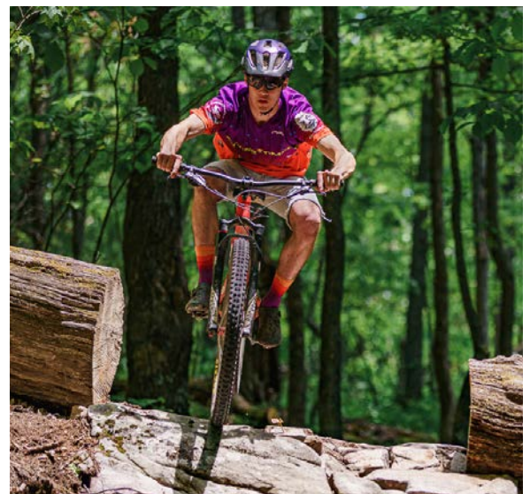
Michael Carnrike/New River Land Trust

Blacksburg is a beautiful town located in the New River Valley of Virginia, nestled on a plateau between the Blue Ridge and Allegheny mountains. Blacksburg serves as the hub of the Roanoke/New River Valley region. Established in 1798, Blacksburg has grown from a town of a few dozen families to a population of over 45,000 people, making it one of the largest towns in Virginia. The town is comprised of a healthy, highly educated, and diverse population, making it a very progressive community with a high quality of life. Blacksburg has activities that appeal to young professionals, families, and seniors. There are numerous parks to choose from, including the Brush Mountain Park (right), making the town an excellent venue for the outdoors lover.