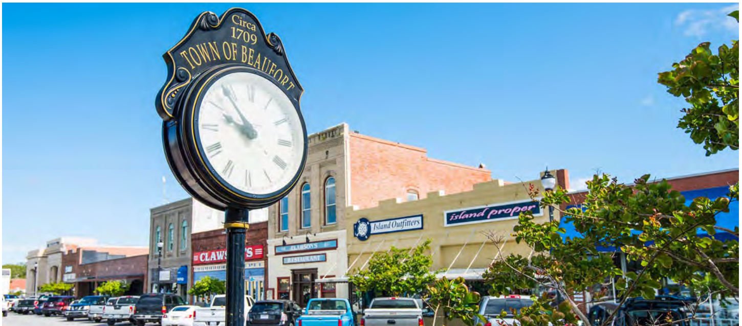
Dine, shop, stay and play in quaint and charming downtown Beaufort.

The Town of Beaufort, NC is an Equal Opportunity Employer.