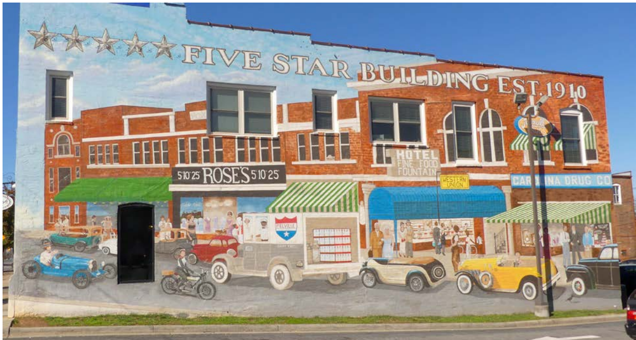
A colorful mural painted on one side of the historical Five Star Building — a beautifully restored mixed-use building in downtown Mebane, which features office spaces, street level retail and boutique apartments.

The City of Mebane is an Equal Opportunity Employer.