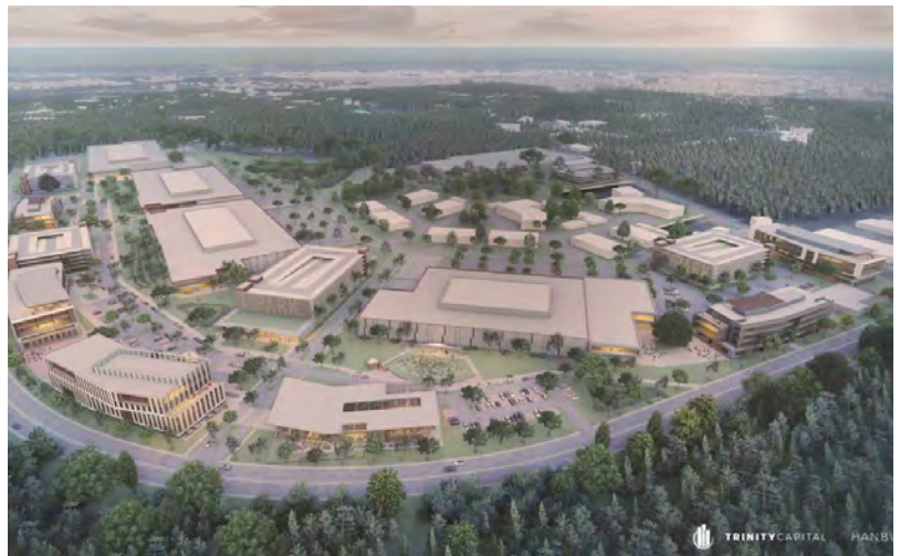
A groundbreaking ceremony was held in 2023 (left) on Spark LS (right) — a 109-acre advanced life science campus in Morrisville, which will feature 1.5 million square feet of cutting-edge lab and bio-manufacturing space.