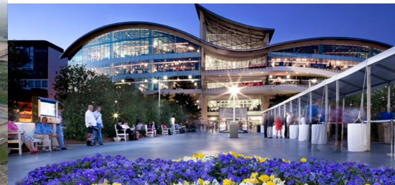
The High Point Market, held twice a year, is the largest wholesale finished goods home furnishings market in the world and has a tremendous economic impact on the entire Pledmont Triad.