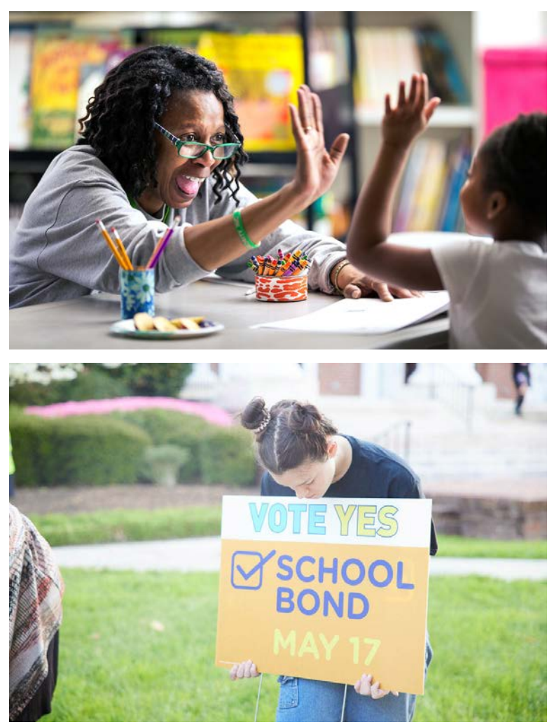
The next President will build collaborative relationships between the community and schools—a crucial component of public-school success.