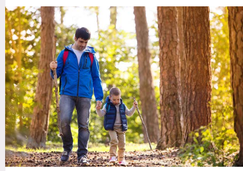
Guilford County offers community residents so many opportunities to enjoy the outdoors — from hiking and and mountain biking trails to greenways, parks and lakes.