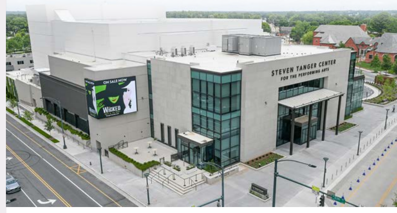
The <u>Steven Tanger Center for Performing Arts</u> is a state-ofthe-art-multi-purpose facility with a seating capacity of 3,000.

Guilford County is a growing and vibrant community with so much to offer its diverse population.