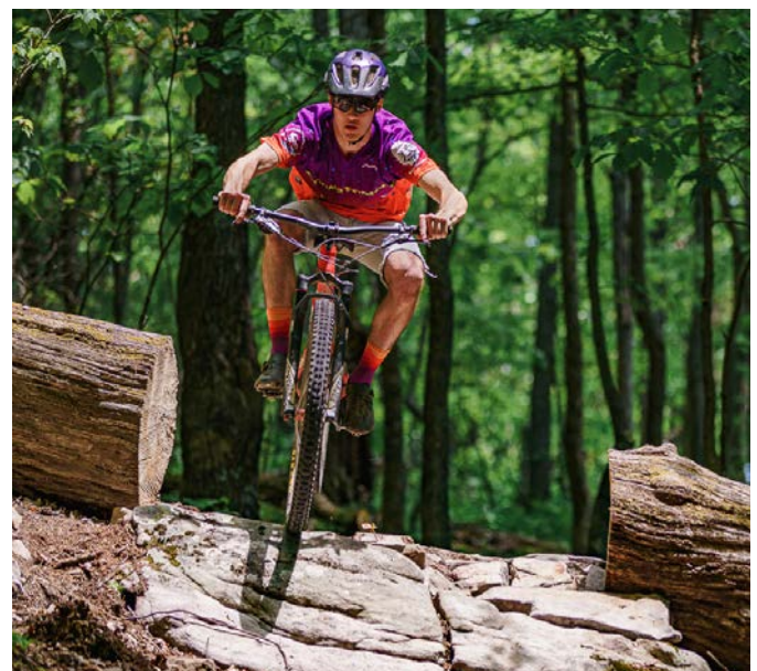
Michael Carnrike/New River Land Trust

Blacksburg is a beautiful town located in the New River Valley of Virginia, nestled on a plateau between the Blue Ridge and Allegheny mountains. Blacksburg serves as the hub of the Roanoke/New River Valley region. Established in 1798, Blacksburg has grown from a town of a few dozen families to a population of over 45,000 people, making it one of the largest towns in Virginia. The town is comprised of a healthy, highly educated, and diverse population, making it a very progressive community with a high quality of life. Blacksburg has activities that appeal to young professionals, families, and seniors. There are numerous parks to choose from, including the Brush Mountain Park (right), making the town an excellent venue for the outdoors lover.