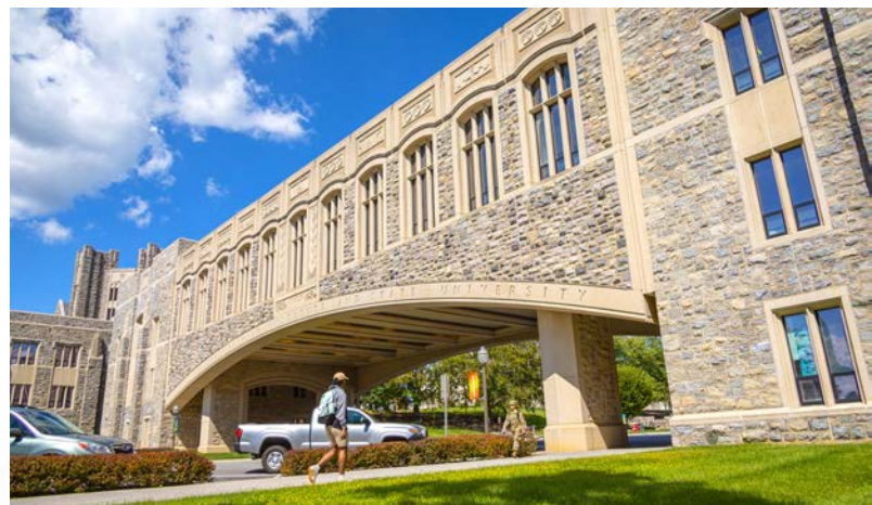
Torrgergen Bridge, a well-known landmark, at Virginia Tech