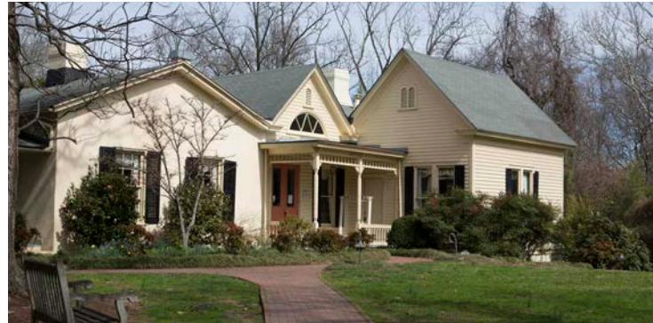
The Town of Chapel Hill is filled with historic architecture, such as the Horace-Williams house, built in 1854 and today, providing meeting and event space, art exhibitions, and public education programs.

Chapel Hill is a recognized pioneer in education, research, and innovation – a place where ideas are born. Home to brilliant minds, award-winning restaurants, innovative businesses, highly rated public schools, museums, galleries, festivals, and athletic events, and a vibrant music and performing arts scene, community members and visitors have abundant opportunities in this creative town. The Town's fare-free transit system provides community members with accessible transportation.