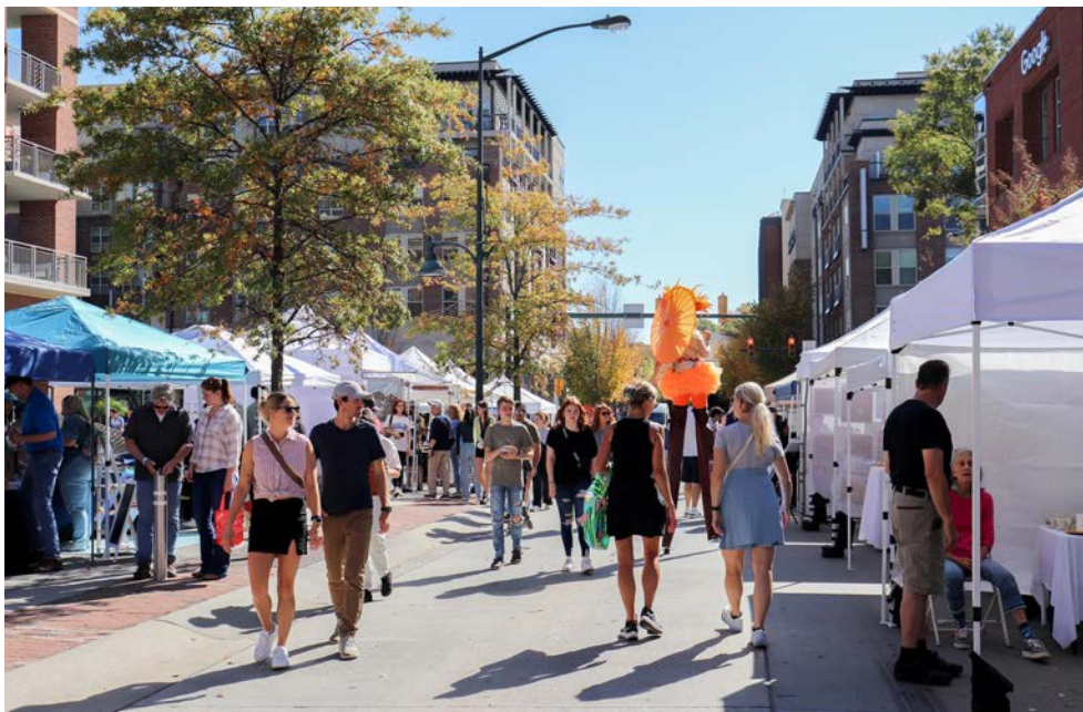
Chapel Hill's Festifall is a popular, three-event arts festival held annually in October along Franklin Street. The street market features artisan vendors, performances, music and more and is a must-do event for community members and visitors alike!

The Town of Chapel Hill is an Equal Opportunity Employer.