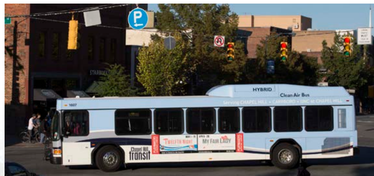
Chapel Hill has a fare-free transit system, which provides community members with accessible transportation.