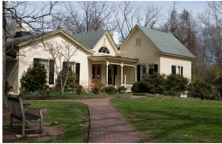
The Town of Chapel Hill is filled with historic architecture, such as the Horace-Williams house, built in 1854 and today, providing meeting and event space, art exhibitions, and public education programs.

Chapel Hill is a recognized pioneer in education, research, and innovation – a place where ideas are born. Home to brilliant minds, award-winning restaurants, innovative businesses, highly rated public schools, museums, galleries, festivals, and athletic events, and a vibrant music and performing arts scene, community members and visitors have abundant opportunities in this creative town. The Town's fare-free transit system provides community members with accessible transportation.