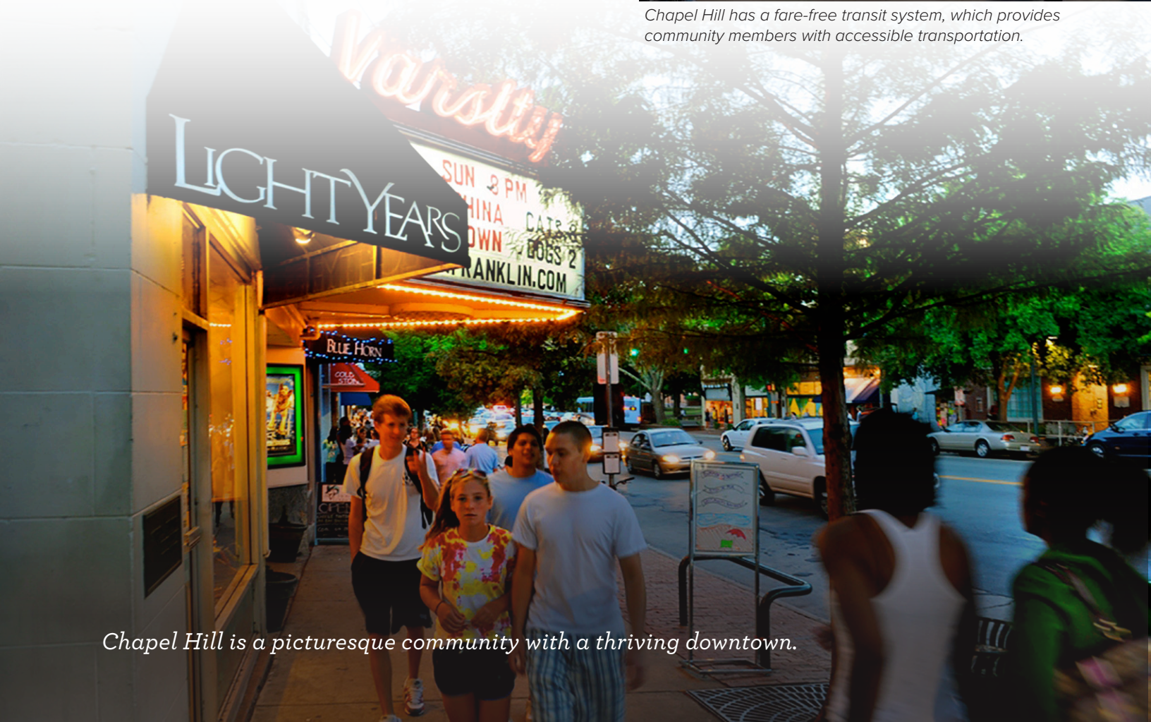
Chapel Hill is a picturesque community with a thriving downtown.