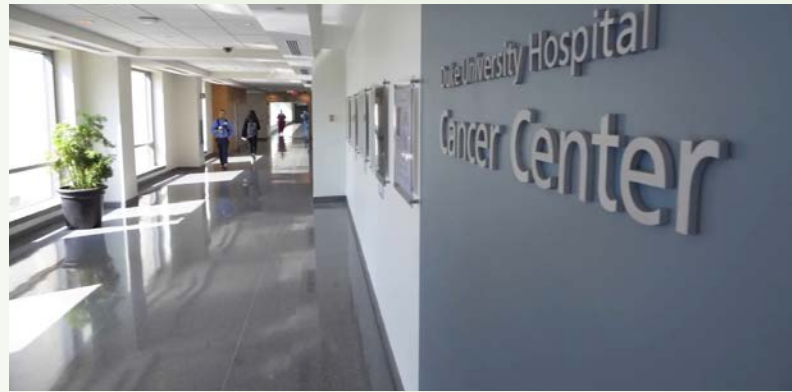
Durham is renowned for its world-class medical facilities.