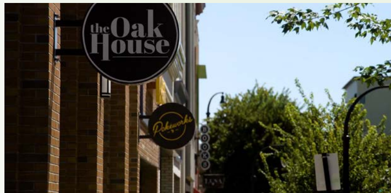
Downtown Durham bustles with diverse restaurants, breweries and small businesses.