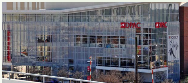
The Durham Performing Arts Center, known as the DPAC, is the largest performing arts center in the Carolinas.