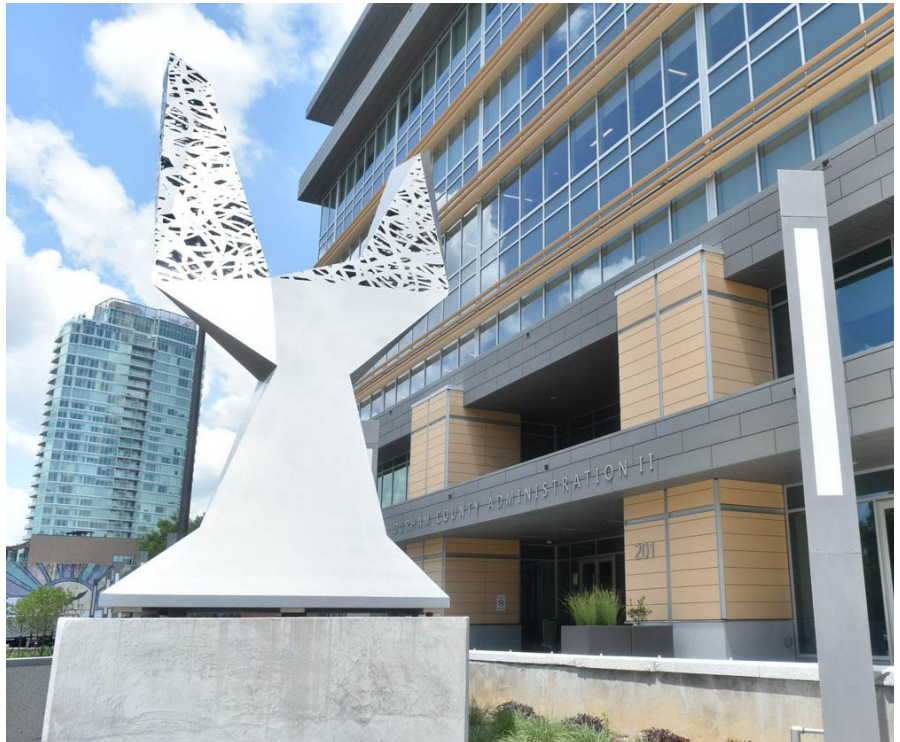
The CFO works out of the Administration II Building on the 7th floor in downtown Durham, which bustles with businesses small and large, eclectic restaurants, historic buildings and so much more!

Bachelor's degree in finance, accounting, or related field. A Master's Degree and/or Certified North Carolina Local Government Finance Officer designation or CPA preferred. Ten years of progressive leadership experience in governmental finance or organization-wide financial management, including five years of supervisory experience preferably in a local government setting. An equivalent combination of education, training and experience will be considered. North Carolina Local Government Finance Officers Certification is required within one year of hire, contingent upon the availability of the courses. Must have the ability to be bonded and possess a valid driver's license in the State of North Carolina.