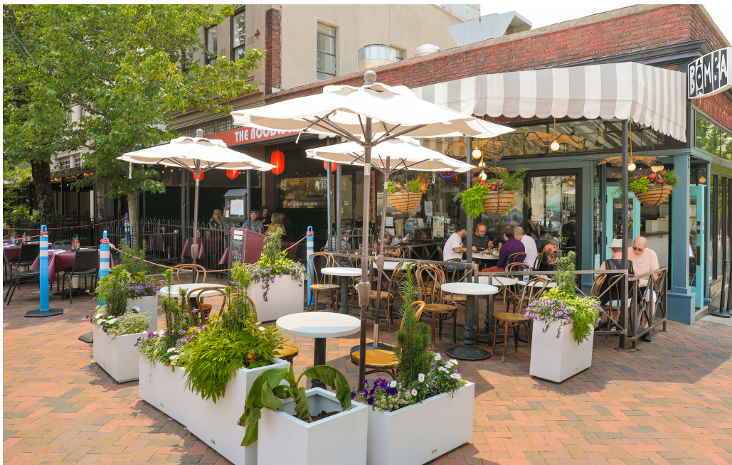
Asheville has it all — routinely ranked in U.S. top ten lists for living, food, arts and other features. (smartstop)

To learn more about the selection process, visit https://developmentalassociates.com/client-openings/ , select “Client Openings” and scroll down to “Important Information for Applicants.” All applications must be submitted online via the Developmental Associates application portal – NOT the organization’s Employment Application portal, nor any other external website; it is not sufficient to send only a resume. Resumes and cover letters must be uploaded with the application. Applicants should apply by April 19, 2023. Successful semi-finalists will be invited to participate in virtual interviews and skill evaluation on May 23 - 24, 2023. Candidates are encouraged to reserve these dates for virtual meetings should they be invited to participate. All inquiries should be emailed to hiring@developmentalassociates.com . Liberty Corner Enterprises is an Equal Opportunity Employer.