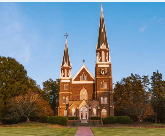
Belmont Abbey College is one of 49 colleges and universities close to Belmont.