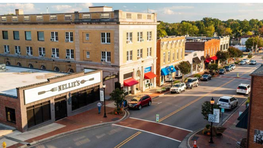
Revitalization and redevelopment are bringing new life to downtown Belmont and Main Street.

The City's community members, of which 81% are white, 11% African American, 3% Asian, and 3% Hispanic or Latino, unite around many events throughout the year that honor the history of Belmont and celebrate its unique small-town culture. The annual National Faith and Blue Weekend facilitates a safe and strong community by engaging law enforcement officers and residents through the connections of faith-based organizations. The annual Garibaldi Festival, which features art, music, and food elevate the rich history of the city's roots.