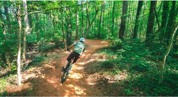
Belmont is a perfect location, providing access to outdoor activities, such as mountain biking at Rocky Branch Park (above) and running the Carolina Thread Trail (below).