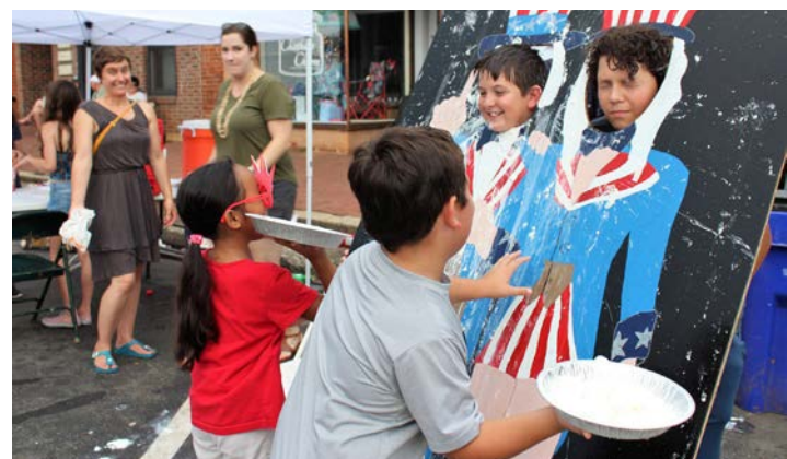
BIG fun in a small town at the annual Summer Fest, held in downtown Pittsboro every year in July.