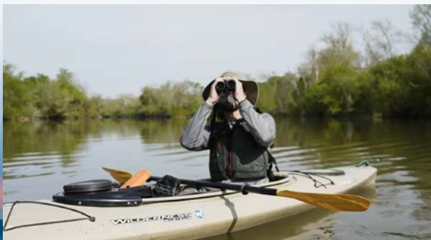
Jordan Lake, a nearly 20,000-acre reservoir near Pittsboro, and nearby Haw River (left photo), provide a vast array of recreational opportunities, year round.

Pittsboro is home to the Pittsboro campus of Central Carolina Community College, which offers a core curriculum as well as continuing education in such areas as Sustainable Agriculture and Alternative Building Techniques. Within a short distance of Pittsboro is the University of North Carolina at Chapel Hill, North Carolina Central University, Duke University, and North Carolina State University, as well as a cluster of private and community colleges. These universities and colleges serve not only as excellent academic centers, but also as research centers, medical centers, and employment centers within and nearby to the community of Pittsboro.