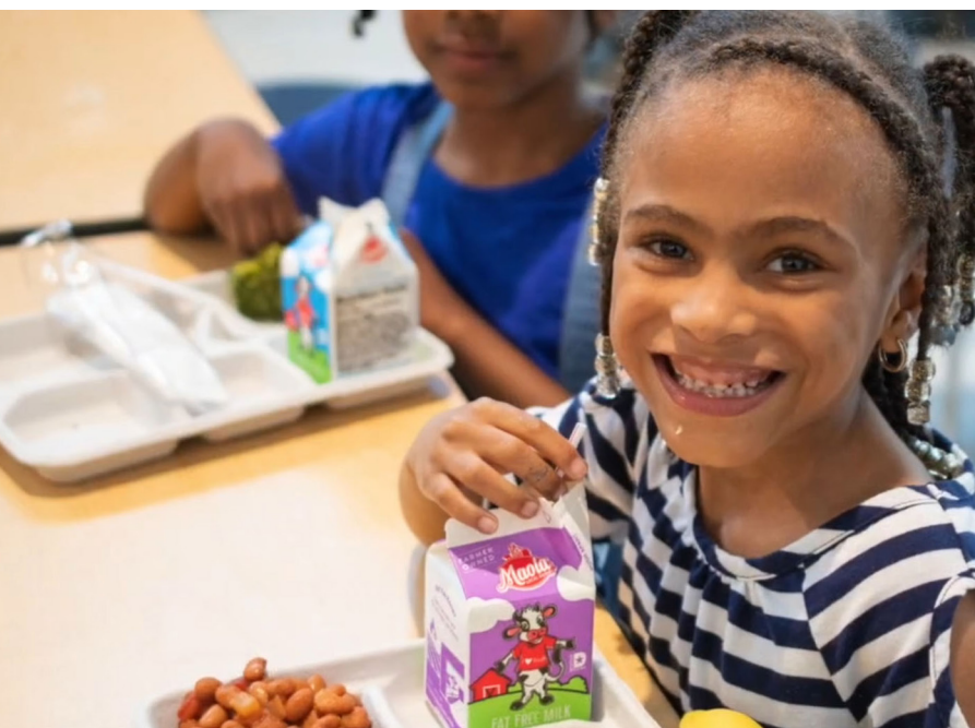
Ensuring every child has access to quality early education programming is a key goal for Durham County Department of Social Services staff.

As the County continues to experience growth and the Department is challenged with a current vacancy rate of 17%, the social services staff are increasingly pressured with navigating and supporting the needs of its constituents. With 14% of the County's population 65+ years old, rising eviction rates and a decline in affordable housing, the Department is seeing an increase in individuals seeking assistance and services from DSS. The next Director will successfully balance proactive and reactive approaches to problem solving when navigating both internal and external factors that impact the Department, its services and staff and the overall well-being of the community.