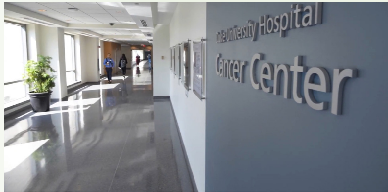
Durham is renowned for its world-class medical facilities.