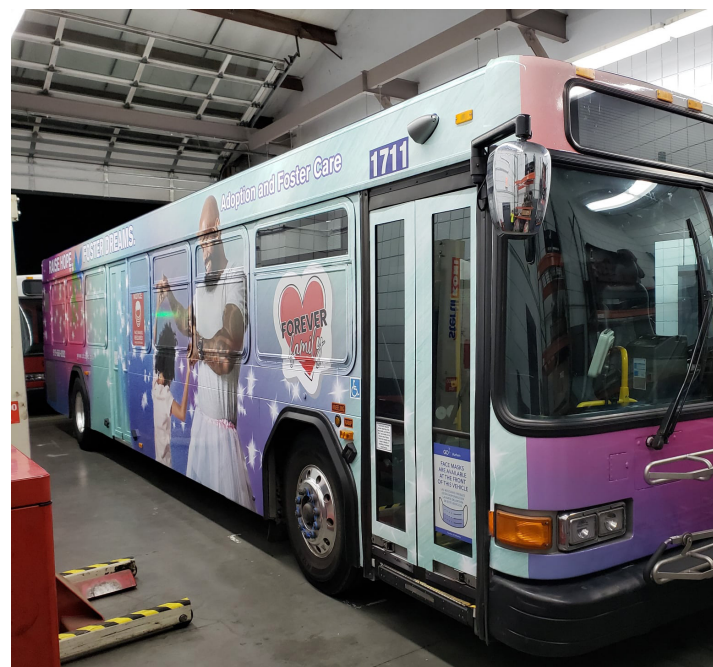
Get on the Bus! The Durham County Social Services "Foster Care Bus" got a makeover with this colorful, eye-catching wrap!