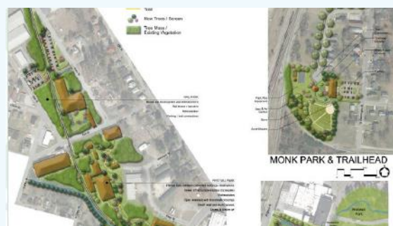
Walking, jogging and biking the Monk to Mill Trail, an urban trail, which will run between downtown Rocky Mount and Rocky Mount Mills.