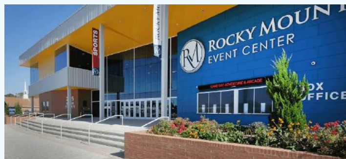
Watching — and playing — a variety of sports at the Rocky Mount Sports Complex, which includes multiple baseball/softball fields, eight soccer/football fields, a professional disc golf course, two outdoor basketball courts, outdoor volleyball courts, picnic shelters and a walking trail.