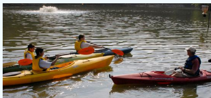
Kayaking on Indian Lake, a 6 ½-acre lake located in Tarboro.