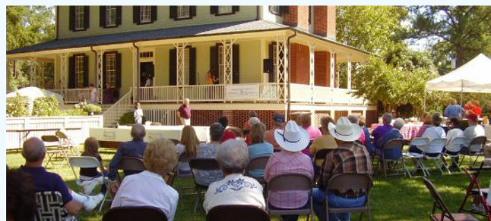
Visiting the historic Blount-Bridgers House, an 1808 plantation home that now serves as a museum and home to the Edgecombe County Cultural Arts Council.

With its 10 municipalities, Edgecombe County is an area rich in history, culture and recreational opportunities.