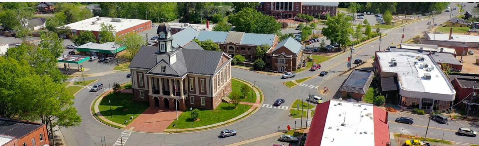
The traffic circle in downtown Pittsboro gives the town its nickname “The Circle City”.