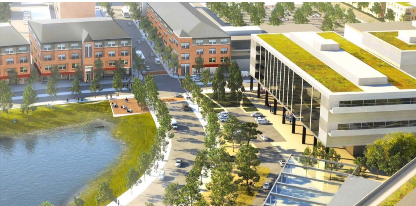
Artistic rendition of a portion of Chatham Park — 22 million square feet of commercial, office and civic space, which will occupy more than 7,000 acres the east of Pittsboro.

er will have the natural ability to unite teams, establish trusting relationships and build a cohesive culture across departments. In the process of facilitating the Town's next strategic plan, the Town Manager will be tasked with preserving the strong sense of community — protecting the Town's history and excellent quality of life as the community grows.