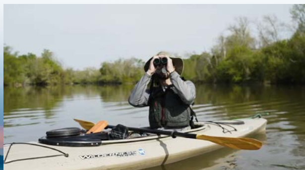
Jordan Lake, a nearly 20,000-acre reservoir near Pittsboro, and nearby Haw River (left photo), provide a vast array of recreational opportunities, year round.

Pittsboro is home to the Pittsboro campus of Central Carolina Community College, which offers a core curriculum as well as continuing education in such areas as Sustainable Agriculture and Alternative Building Techniques. Within a short distance of Pittsboro is the University of North Carolina at Chapel Hill, North Carolina Central University, Duke University, and North Carolina State University, as well as a cluster of private and community colleges. These universities and colleges serve not only as excellent academic centers, but also as research centers, medical centers, and employment centers within and nearby to the community of Pittsboro.