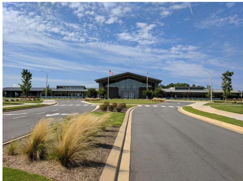
Chatham County Agriculture and Conference Center

With its temperate climate, proximity to the mountains of NC and an easy drive to Atlantic Ocean beaches, the Town of Pittsboro provides community members access to all of what makes the State of NC special. With a rich agricultural history, Pittsboro is home to over 1,100 farms, some of which sell at farmers markets and to local fine dining restaurants. In fact, Pittsboro leads the State's Sustainable Agriculture Program and an Innovative Culinary Program on the Pittsboro campus of Central Carolina Community College and utilizes produce from local farms for programming. The county Agricultural and Industrial Fair is held inside Town limits every Fall, and for over 70 years has been owned and managed by a non-profit collaborative of African American community leaders. The Chatham