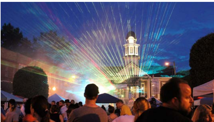
Laser show at Summer Fest