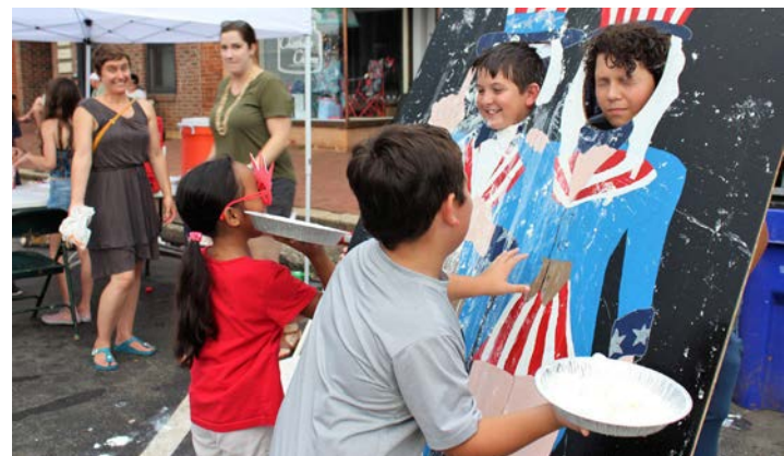
BIG fun in a small town at the annual Summer Fest, held in downtown Pittsboro every year in July.