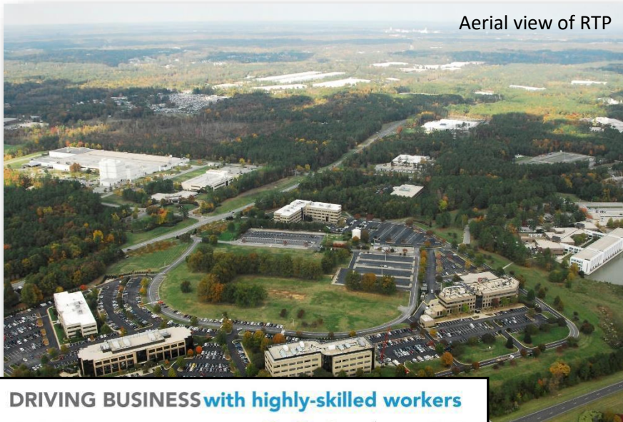
Aerial view of RTP

Durham County, located in the Research Triangle Region of North Carolina, is home to Research Triangle Park (RTP) and is one of the most economically competitive regions in the world. Within Durham County boundaries, there are six townships, seven unincorporated communities, two census designated communities, and parts of two Towns (Chapel Hill and Morrisville). With the City of Durham as the County seat, the County is inclusive of both urban and rural settings and must strive to balance the needs of its community members. Research and development from the region's major research institutions, and many private and federal labs, have fueled business and economic growth in Durham County and have made the region a world leader in life sciences,