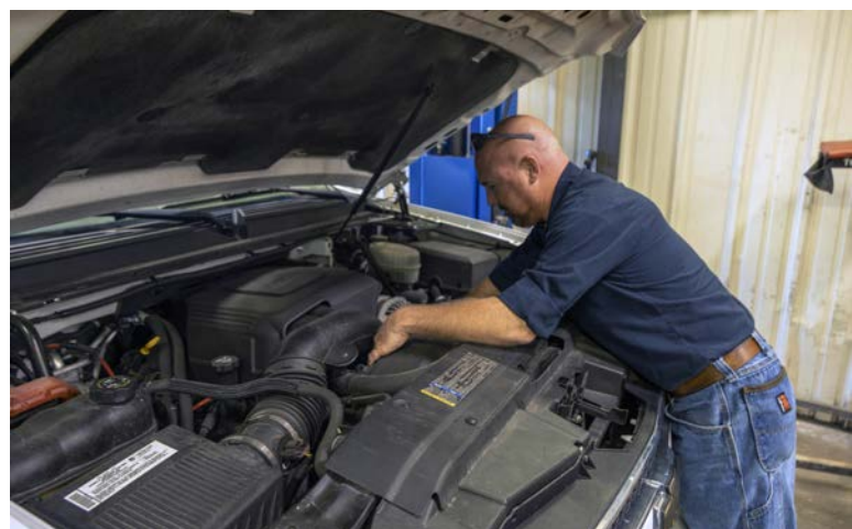
Maintenance of the town's fleet of vehicles and equipment

To learn more about the department, visit: