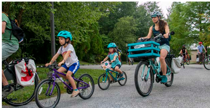
The annual Blacksburg Bike Parade to create sustainability is a fun, family-friendly event that begins at the Virginia Tech Electric parking lot and ends at the Blacksburg Farmers Market.

At the core of Blacksburg's vibrant and engaging downtown is Virginia's largest land-grant university, Virginia Tech. The university continues to position itself as a major research institution. The presence of Virginia Tech as a corporate community member brings significant advantages to the economy of the town. The combination of approximately 37,000 students and 13,000 faculty, administrative staff and support positions brings significant buying power to the merchants and tax base of the town. Growth in technology-based research and the spawning of businesses from the university's research park, the Corporate Research Center, reflect well on the area. The wealth of resources offered by a major academic institution makes the town an attractive venue for businesses.