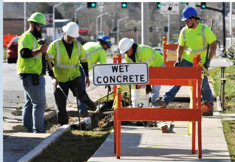
Sidewalk repair is one of many responsibilities of the Blacksburg Public Works Department.