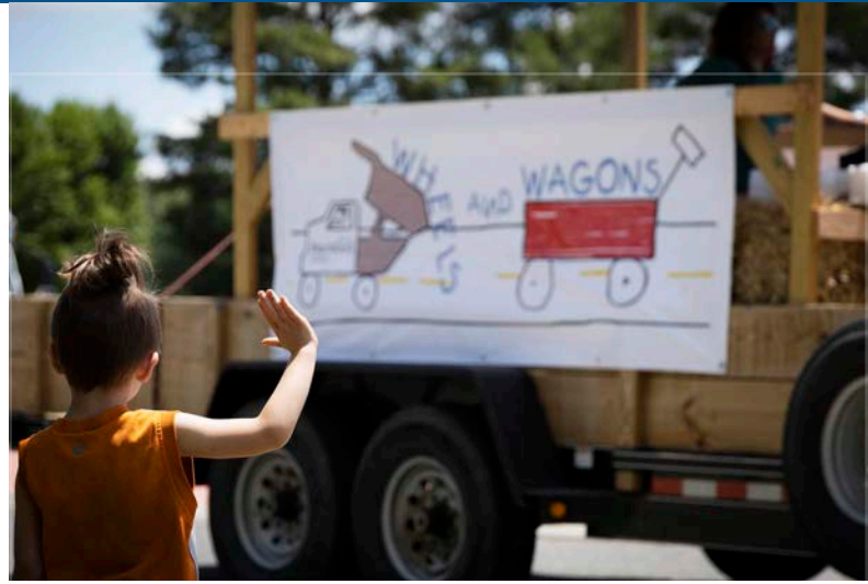
The Town of Blacksburg hosts an annual “Wheels and Wagons” parade, which features a fleet of dump trucks, snow plows, fire trucks, police cars, buses, and more.

Since 1952, the Town of Blacksburg has been organized under the Council-Manager form of government. Council members are elected for four-year terms and are elected on a staggered basis, with elections held every two years. The Blacksburg Town Council, comprising seven members, serves as the legislative body of the local government and is responsible for adopting all ordinances and resolutions, approving the annual operating and capital budgets, setting all tax rates, approving the five-year Capital Improvement Program, setting all user fees, making land use and zoning decisions, and establishing long-range plans and policies. The mayor is elected and has the right to vote on matters brought before the governing body. The council appoints the Town Manager to act as the administrative head of the town. The 2021-22 Operating Budget totals $114 million for all funds.