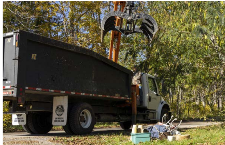
Residential spring and fall cleanup

Among some of the services provided by the Public Works Departments are: