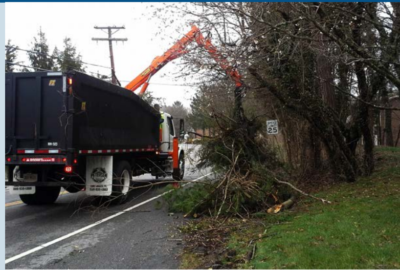
The Public Works Department staff provide leaf and debris collection for Town of Blacksburg residents.

Bachelor's degree with coursework in civil engineering, or related field and a minimum of 10 years of increasingly responsible experience in public works, engineering, or related fields, including 5 or more years of budget and supervisory responsibility is required OR equivalent combination of education and experience. Master's Degree preferred. Valid driver's license in the Commonwealth of Virginia required.