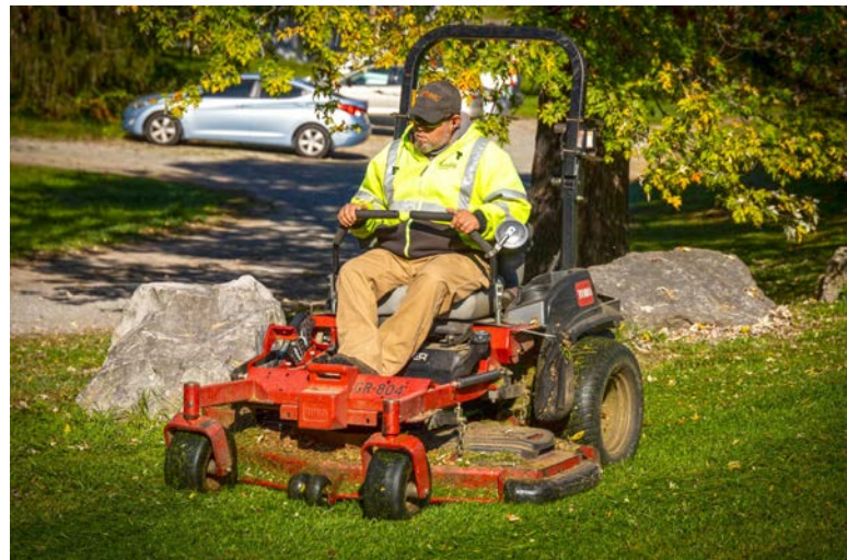
Maintenance of town-owned properties