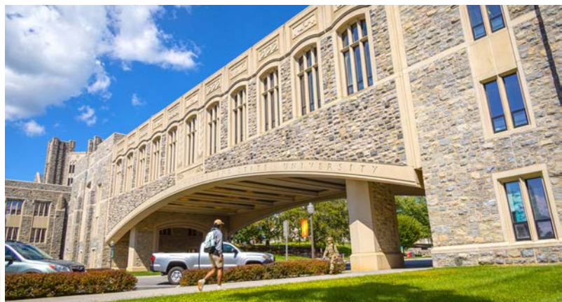
Torrgeresen Bridge, a well-known landmark, at Virginia Tech