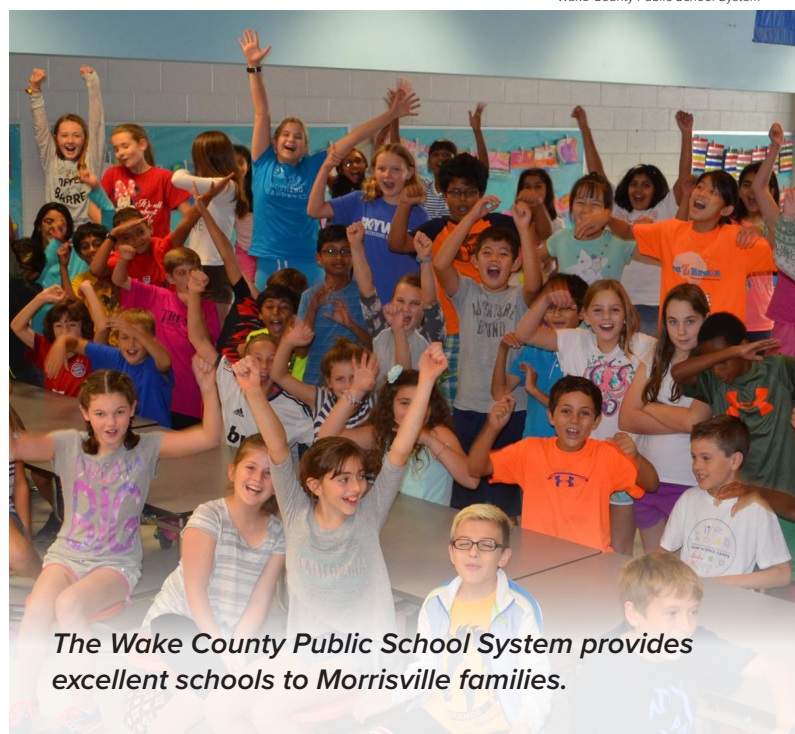
The Wake County Public School System provides excellent schools to Morrisville families.