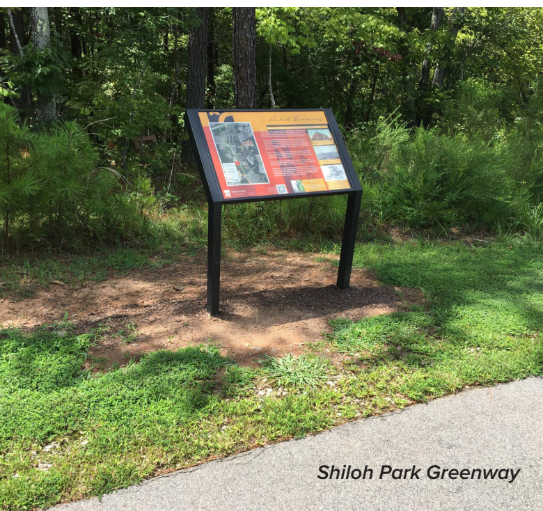
Shiloh Park Greenway

The idea of living connected and living well guides the Town's decision-making processes in all areas and has been the catalyst for infrastructure improvements to roadways, greenways, and recreational facilities.